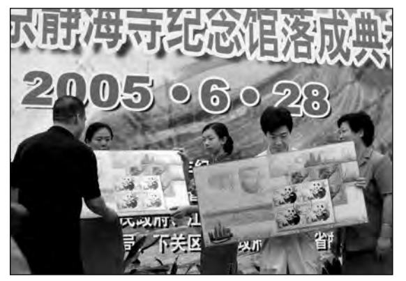
Dedication ceremony for the Zheng He Memorial Hall in Jinghai Temple, Nanjing, Jiangsu province, June 28, 2005.

Scholarship can help Asia-watchers comprehend what Beijing is up to as it propagates its Zheng He narrative. Scholars of international security affairs explain a nation's strategic choices—such as China's decision to reorient its foreign policy seaward—partly in terms of