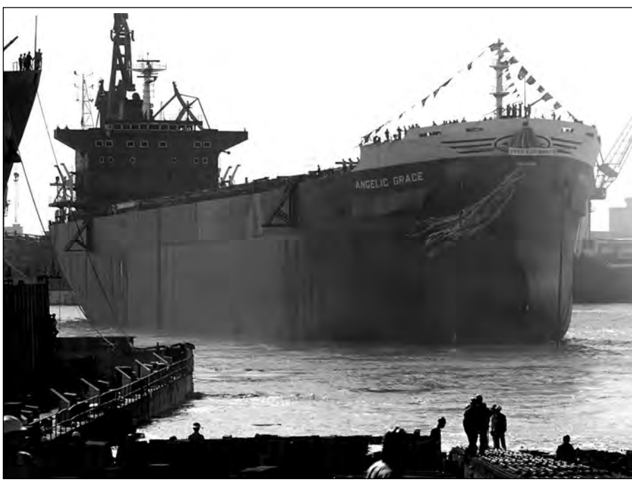
Launch of a new ship at a shipyard in Shanghai.

Chinese officials thus use Zheng's expeditions of commerce and discovery to portray China as a beneficent, non-threatening power. Chinese power, they suggest, is intrinsically self-denying, and history proves it. Declared Premier Wen Jiabao while visiting the United States, Zheng "brought silk, tea and the Chinese culture" to foreign peoples, "but not one inch of land was occupied." Guo Chongli, China's ambassador to Kenya, proclaimed, "Zheng He's fleet [was] large . . . . But his voyages were not for looting resources"—code for Western imperialism—"but for friendship. In trade with foreign countries, he gave much more than he