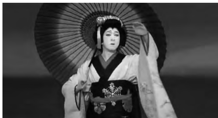
Screen capture from the video, Tamasaburo "Sagi Musume" at http://tiny.cc/3qfbuw .

URL: http://www.youtube.com/results?search_query=tamasaburo