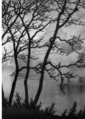
Okayama Castle by Hasui Kawase.

This is another example of a commercial site that offers useful information about visual arts, in this case, the ukiyo-e of Japan. There are hundreds of examples of prints, mostly from the nineteenth and twentieth centuries. If one is interested in a particular artist, the site map (link in lower left) organizes the prints alphabetically by artist.