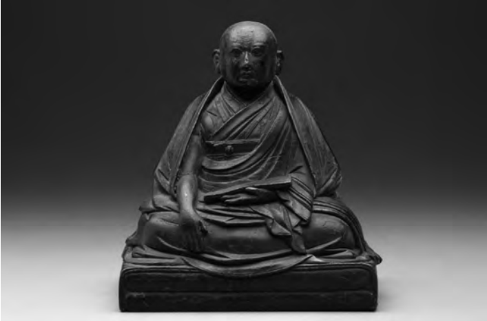
Small bronze statue of Losang Gyatso, the Fifth Dalai Lama.