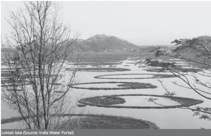
Loitak lake

Note that when possible, I have left the original URLs intact, though longer or more complicated web addresses have been condensed with Google's link shortener. If you know of additional sources that would be worth attention, please send me an email (jhall@hotchkiss.org) for inclusion as an online supplement.