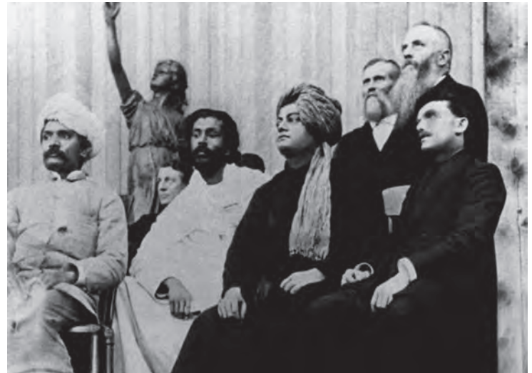
Vivekananda in Chicago for the 1893 Parliament of World Religions.

Okakura displays the same eagerness as Vivekananda does for unity in a turbulent world. While he does not use the term Advaita in The Book of Tea , in his The Ideals of the East , he approvingly writes of Japan's "spirit of living Advaitism which welcomes the new without losing the old." And as Vivekananda speaks of "unity in variety" as the "plan of nature," so Okakura refers in Ideals to "unity-in-complexity" as something that Japanese culture has managed to express. Turning to The Book of Tea , Okakura alleges that "[t]he eternal is to be found only in the spirit" toward which art points. Similarly, Zen Buddhist practice is "aimed at direct communion with the inner nature of things," a process that an art form like the tea ceremony does much to foster. Indeed, the entire ceremony for Okakura is "essentially a worship of the Imperfect." The Imperfect? This is not as strange as it sounds. Later in The Book of Tea , Okakura equates "Zennism" with Daoism, or reverence for the Dao. Regarding this Dao, he states that "[i]ts Absolute is the Relative"—which is to say the "Imperfect" referred to above. Thus, much as Vivekananda's Hindu uses his/her individuality as a stepping-stone toward something more universal, so the strikingly imperfect implements