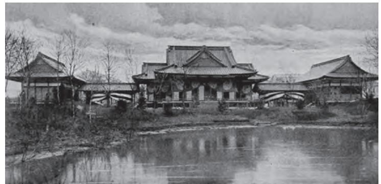
Japanese Hōōden at the 1893 Columbian Exposition.

of Okakura's tea ceremony serve as mere stepping-stones toward an experience of something absolute. Indeed, as far back as China's Song dynasty (960–1279), the consumption of tea was viewed as a method of "self-realisation"—a goal on which Okakura and Vivekananda could agree. 6