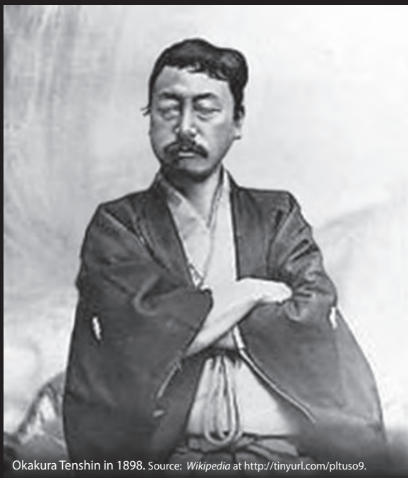
Okakura Tenshin in 1898.