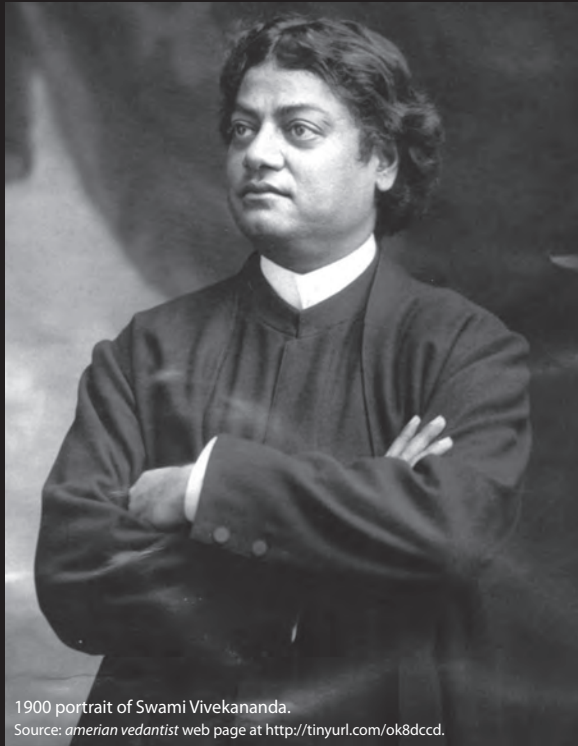
1900 portrait of Swami Vivekananda.