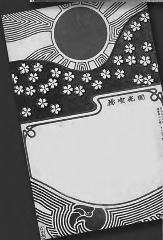
"Rising Sun, Cherry Blossoms, and Eagle"

Right: "The Battle of the Japan Sea with Admiral Tōgō, #4"