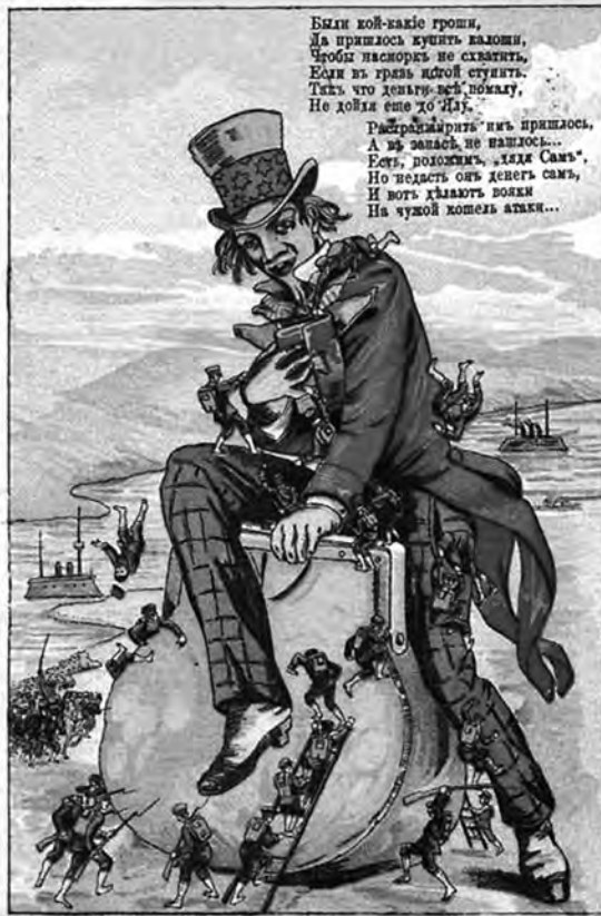
Uncle Sam Sitting on a Big Purse Attacked by Tiny Japanese Soldiers.

Editor's Note: New EAA subscribers might not be aware of Visualizing Cultures , founded in 2002 by Massachusetts Institute of Technology Professors Shigeru Miyagawa and John Dower. Visualizing Cultures , which uses technology to blend images, video, and text into superb interactive teaching units, is the source for all the graphics in this photo spread. Readers interested in the Russo-Japanese War are particularly encouraged to explore the units titled "Throwing off Asia," "Asia Rising," and "Yellow Promise/Yellow Peril." These are on the "Visualizing Cultures" Web site at http://ocw.mit.edu/ans7870/21f/21f.027j/menu/index.html .