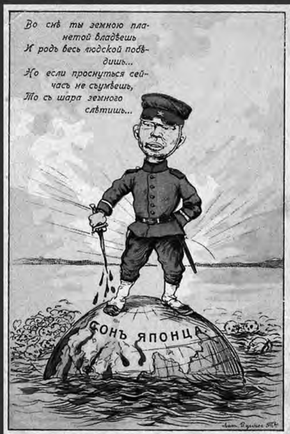
Above: “The Dream of a Japanese” by Georges Bigot . Russian text: In your dreams you own the planet, And all of mankind you'll conquer. But if you don't manage to wake up right now, You'll fly off the face of the Earth.