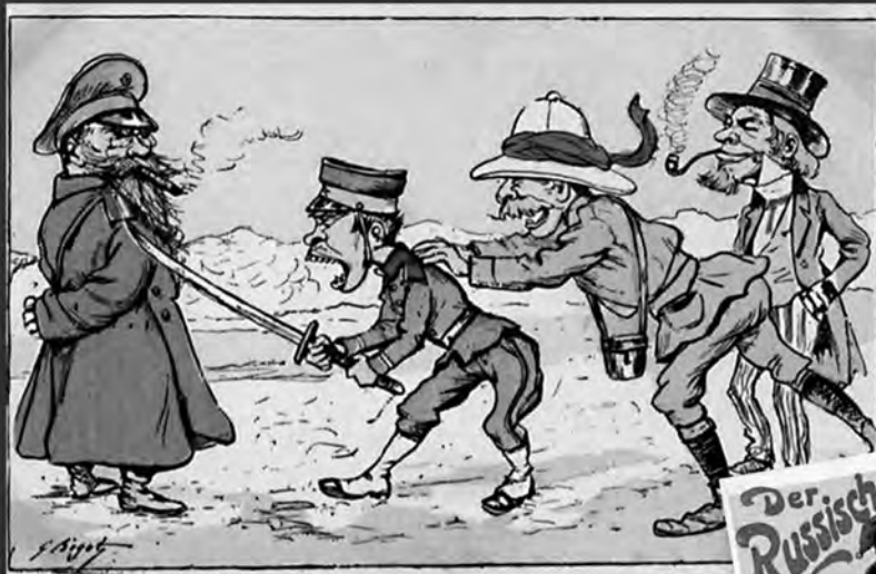
“Japanese soldier challenging Russian soldier, urged on by an Englishman and Uncle Sam” (from a series by Georges Bigot)