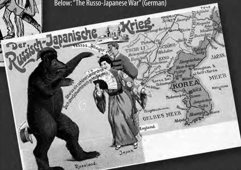
Below: “The Russo-Japanese War” (German)