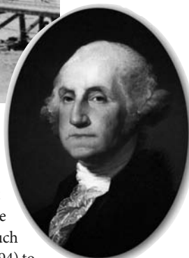
George Washington

A single vessel just arrived in this port pays $30,000 to government. Two vessels fitted out for the fur trade to the northwest coast of America have succeeded well. The whole outfits of vessels and cargoes cost but $7,000. One is returning home loaded with India produce, the other going back to the coast of America; and they have deposited $100,000 of their profits in China. 14