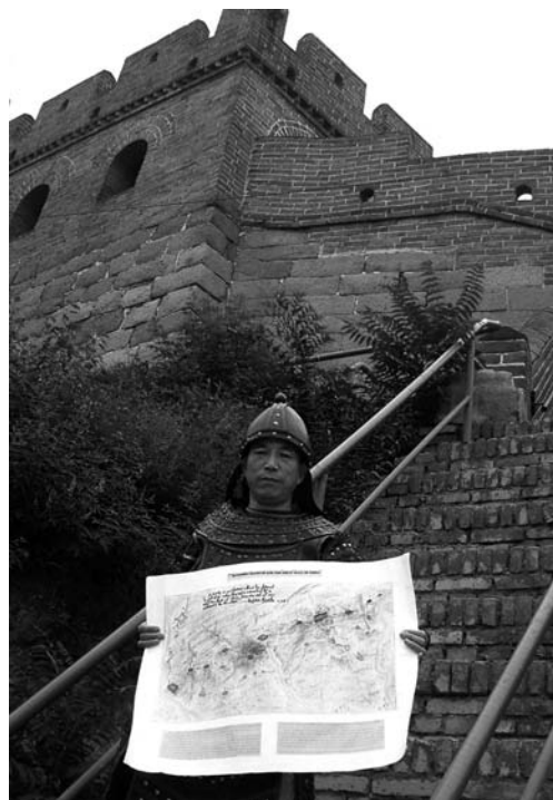
Figure 3. The Great Wall of China. The author, dressed in a traditional Chinese general’s uniform, is holding the map of the defensive wall devised by Benjamin Franklin during the French and Indian War.

Gouverneur Morris.