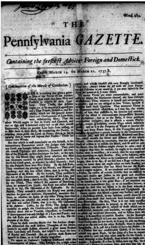
Figure 2. Benjamin Franklin published some chapters from The Morals of Confucius in the 1737 Pennsylvania Gazette , March 14–21, 1737, 8: 484.

Franklin agreed with Confucius that a man should not only cultivate personal virtues, but also disseminate them to others, including political leaders.