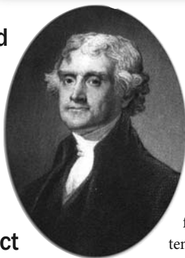
Thomas Jefferson.

Thomas Jefferson used successful American trade with China as an opportunity to move toward establishing a distinct American national identity in China that was clearly separate from the United Kingdom.