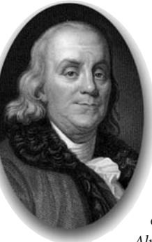
Benjamin Franklin.

Franklin agreed with Confucius that a man should not only cultivate personal virtues, but also disseminate them to others, including political leaders.