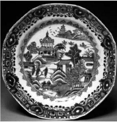
George Washington plate, circa 1780, porcelain, Chinese, for export to the American market. Source: Antiques and the Arts Online at http://tinyurl.com/3js6joa.

The colonists' pursuit of domestic Chinese porcelain ware became a powerful call for patriotic support of American economic independence. Franklin, in London when Rush was promoting colonial porcelain production, echoed this sentiment in a letter to his wife: "I am pleased to find so good progress made in the China Manufactory. I wish it Success most heartily." 10 The American China Manufactory in Philadelphia became noted for its quality, and more importantly, succeeded in cultivating patriotism as it challenged Britain's monopoly of the product and indirectly contributed to the struggle for independence.