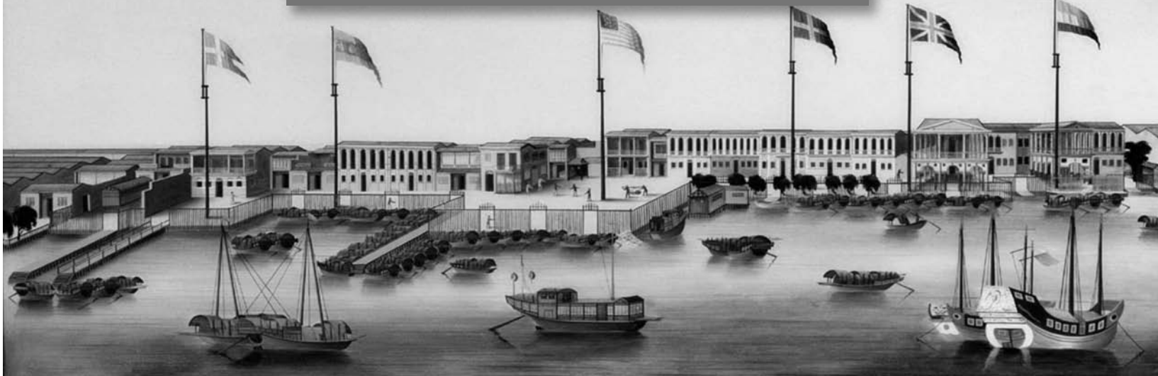
Canton Harbor and Factories with Foreign Flags, c. 1805, China reverse painting on glass. Collection of the Peabody Essex Museum.