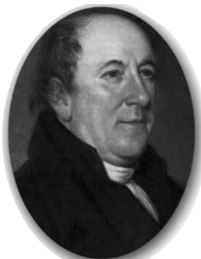
Rufus King.

The China trade was a joint effort by the founding fathers. Robert Morris financed the first American commercial ship to China; George Washington helped choose the business manager; Richard Henry Lee and Rufus King supported the first attempt of the efforts to build an economic relationship with China; and Thomas Jefferson used successful American trade with China as an opportunity to move toward establishing a distinct American national identity in China that was clearly separate from the United Kingdom.