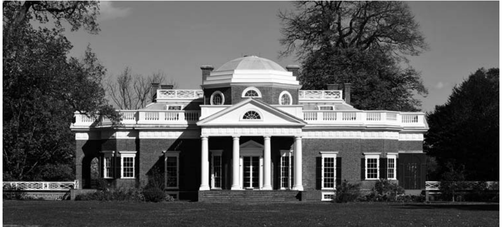
Figure 4. Thomas Jefferson put Chinese railings on the top of Monticello.

Explicit examples of Chinese architectural influences are present in one of the US's most historic buildings. Jefferson developed a new type of architecture by incorporating certain Chinese designs into his famous Italian style house, Monticello. Jefferson used Chinese lattice in many buildings, including Barboursville, the Orange County, Virginia, home he designed. Jefferson also planned to build a Chinese pavilion when he remodeled Monticello in the last decade of the eighteenth century.