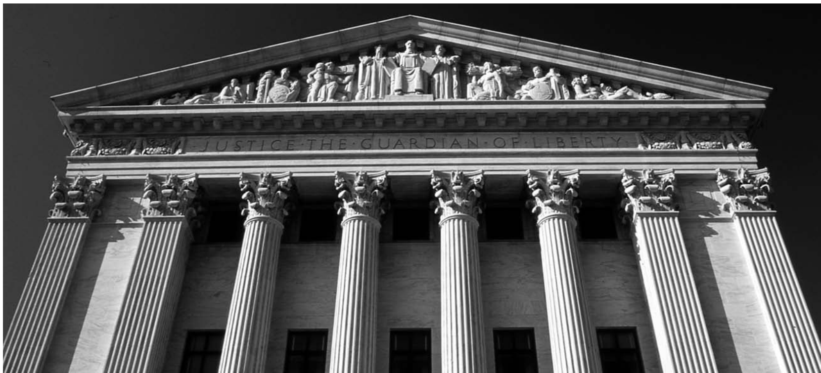
Figure 1. The Sculpture of Confucius along with Moses and Solon above the east entrance of the Supreme Court building.

Walking from the east entrance up the steps to the Supreme Court building, one can see a sculpture of Confucius along with Moses and Solon. The sculpture may serve as an indicator of the impact of Confucius in the formation of American culture. Indeed, Chinese cultural and technological influence on what would become the United States started even before this country was born.