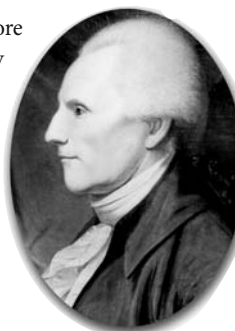
Richard Henry Lee.