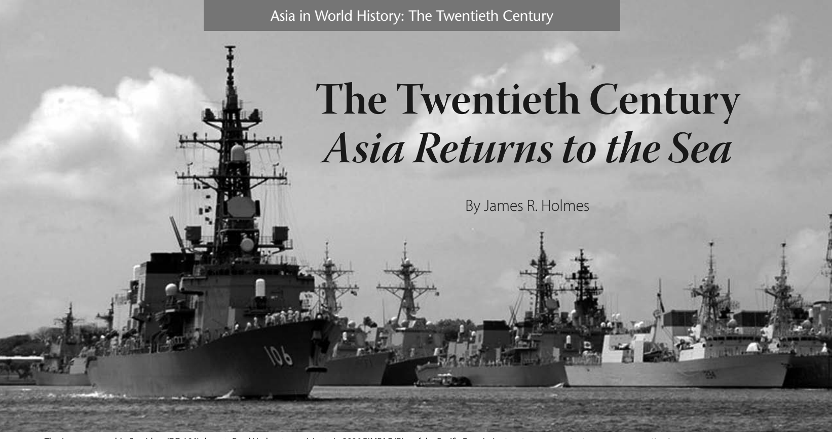
The Japanese warship Samidare (DD 106) departs Pearl Harbor to participate in 2006 RIMPAC (Rim of the Pacific Exercise).