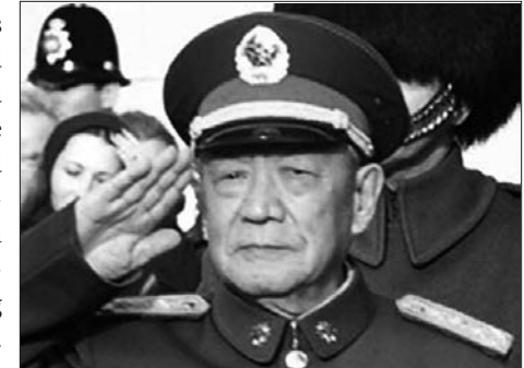
"China's Mahan," Liu Huaqing.

The Asian seas started getting crowded by the end of the Cold War. The rise of the JMSDF foreshadowed the resurgence of indigenous fleets. In China, Mao's death allowed for new thinking about naval power. During Deng Xiaoping's reform and opening era, Admiral Liu Huaqing, commander