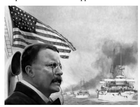
Theodore Roosevelt and the "Great White Fleet."

For Mahan, sea power was founded on three "pillars"—trade, merchant and naval fleets, and overseas bases to refuel and repair steam-propelled vessels.7 Maritime meant far more than naval, then, despite the martial tenor of his writings. The high-seas "great common" provided the American merchant marine and navy their highway to and from East Asia, allowing the United States to carry on robust trade. Providence seemed to smile on the Mahanian cause in 1898, when Admiral George Dewey's squadron smashed a Spanish fleet at Manila Bay—giving America possession of the Philippines, its first naval outpost in East Asia.8