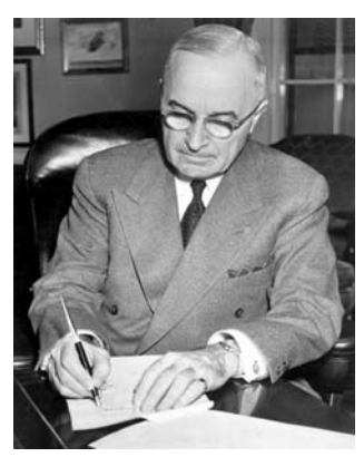
President Truman signing the proclamation declaring a national emergency that source: http://en.wikipedia.org/wiki/File: Truman_initiating_Korean_involvement.jpg.

If China paid the sea little attention, Japan launched into a maritime began US involvement in Korea. Image renaissance. It is little exaggeration to describe the IJN's successor, the