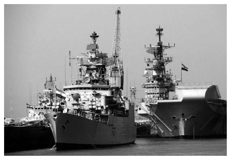
Indian\ Navy\ Ships.

through a "million-man swim" across the Strait. But Beijing defied Western expectations, negotiating purchases of frontline Russian surface warships, diesel submarines, and combat aircraft. It aggressively built up its domestic defense industry, manufacturing its own hardware. And it promoted naval officers to influential posts, bestowing newfound prestige on the PLA Navy and helping the service advance its bureaucratic interests vis-à-vis the army and air force. Many Westerners now acknowledge, if grudgingly, the success of Chinese naval development.