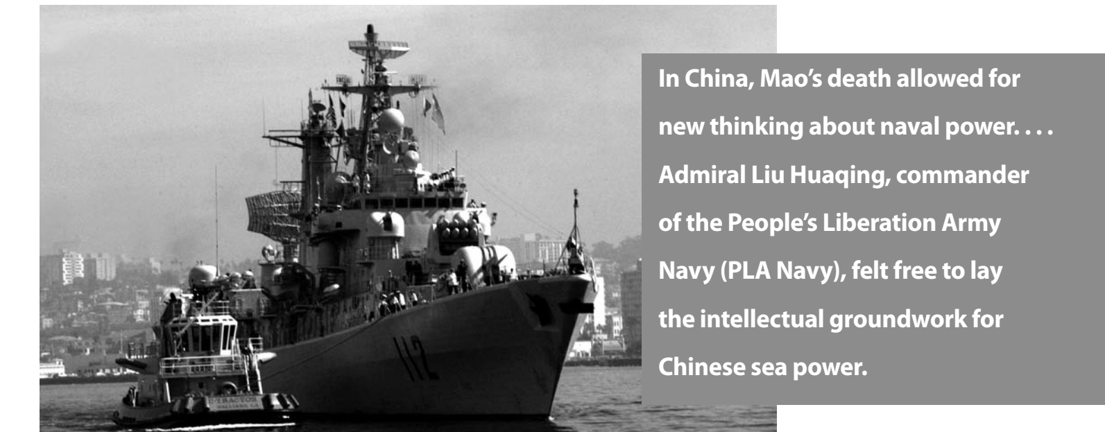
The People's Republic of China destroyer Harbin (DD 112) pulls into San Diego, Calif., on March 21, 1997, for a first-ever visit to the mainland US by People's Republic of China Navy ships.

other missions came to the forefront. The US Navy performed limited combat missions, projecting power into Korea and Việt Nam with gunfire and naval air strikes. Gunboat diplomacy made a comeback. Ships cruising offshore or conducting port visits provided tangible reassurance of America's commitment to the defense of its Asian allies.