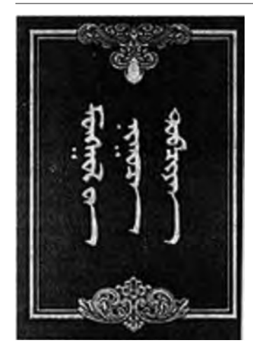
Cover of an edition of The Secret History of the Mongols .