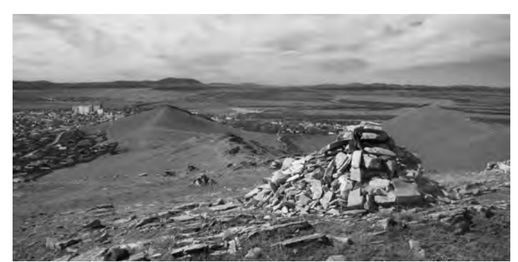
Ovoo worship still links contemporary Mongolians to the religious practices of Genghis Khan.

authority? Are they members of a class of servants or slaves who could not act independently? Or are they enemies?