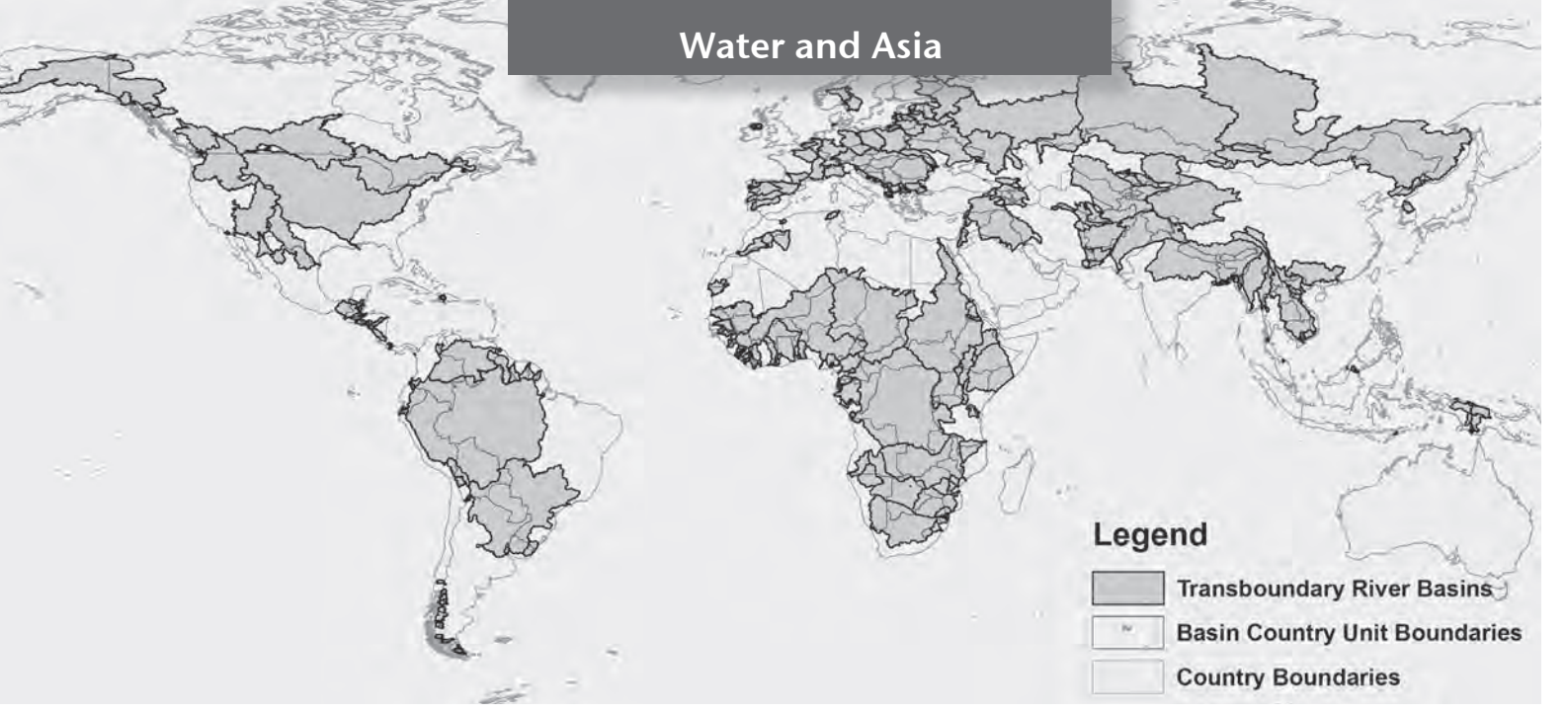
Figure 3. A map of the world's transboundary river basins.