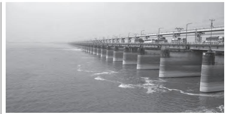
Figure 5. The Farakka Barrage was commissioned in 1975 and enables India to divert water from the Ganges River to the port city of Kolkata, West Bengal.

Regardless of whether the analysis is conducted through the lens of hydro-diplomacy or hydro-hegemony, the conclusion remains: future war over water is exceedingly improbable. As we will discover, however, this truth is little cause for celebration. There has been no evidence of a water war for millennia, but subtler, unspectacular forms of violence involving water occur every day. We now turn our attention to this type of violence.