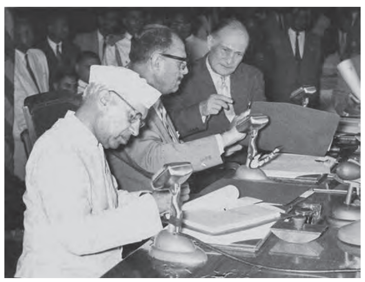
Figure 4. The Indus Treaty was signed in September 1960 by Indian Prime Minister Jawaharlal Nehru and Pakistan President Ayub Khan.