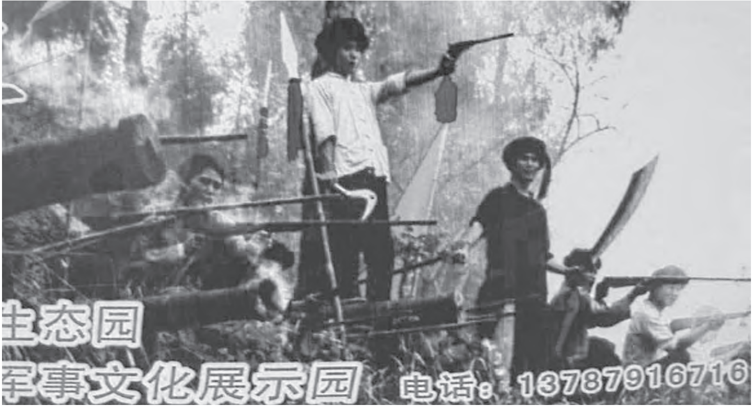
Street poster in Fenghuang, Hunan, proudly advertising a nearby "Military Culture Theme Park," dedicated to Miao resistance to the empire, at Ailikou village near the Southern Great Wall, in 2006.

suppression. The imperial armies even built a southern Great Wall to fend off those mountain Miao who still could not be conquered—in today's Hunan and Guizhou provinces, where the armed resistance to the conquerors is still fondly remembered. In the summer of 2015, an elderly Miao farmer in Guizhou happily sang me a tune that he said was once sung to the nervous soldiers in the imperial Chinese army camps, warning them not to enter Miao country or it would "become their grave!"