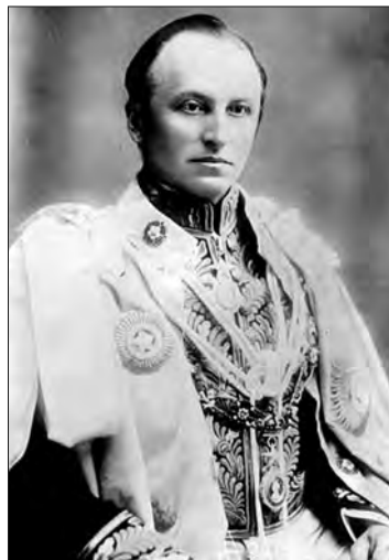
George Curzon (1859–1925) Viceroy of India from 1899 to 1905.