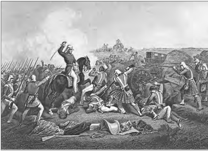
"General Havelock's Attack on Nana Sahib at Futtyporer, 1857," a steel engraving by the London Printing and Publishing Co., late 1850s.