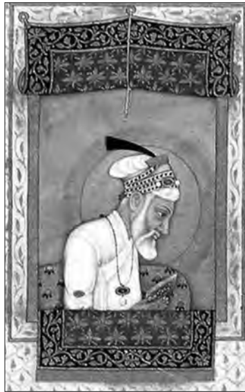
Aurangzeb (Mughal Emperor of India 1658–1707) reading the Quran.

Racism is a core characteristic of the British Empire in India, or, as it came to be known, the Raj (from a Sanskrit word, which found its way into vernacular languages, meaning to rule over, or the sovereign who does so). Historically, the term was applied to Hindu kings (as raja , or maharaja , great king). While implying political superiority, it did not have racial implications. Cultural and political factors were to add racial