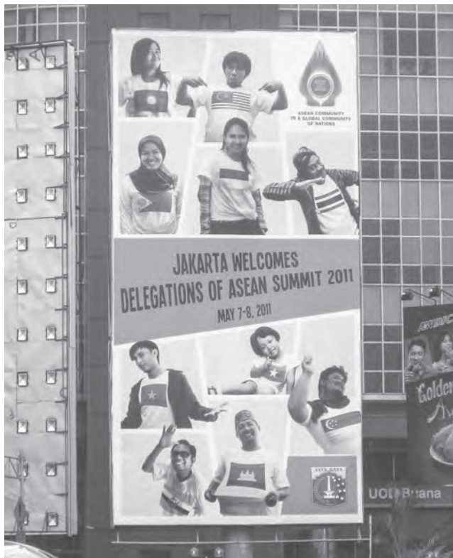
The billboard at Harmoni intersection in Central Jakarta "Jakarta Welcomes Delegations of ASEAN Summit 2011."

them found the APT summit enjoyable and thought that more classes should have active learning exercises as part of the coursework. Furthermore, 85 percent of them felt like a diplomat negotiating on behalf of the country they were representing, while 73 percent considered the meeting connected to real world issues. The postsimulation survey also indicated that email and discussion boards were generally the preferred tool of online diplomacy in comparison to group pages and online chats; results are shown in table 1 on page 48.