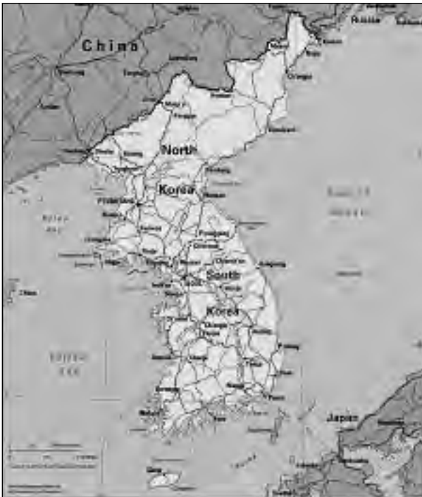
Map of Korean Peninsula

Today that have been translated into English. Biographies of the authors accompany presentations of some of their works.