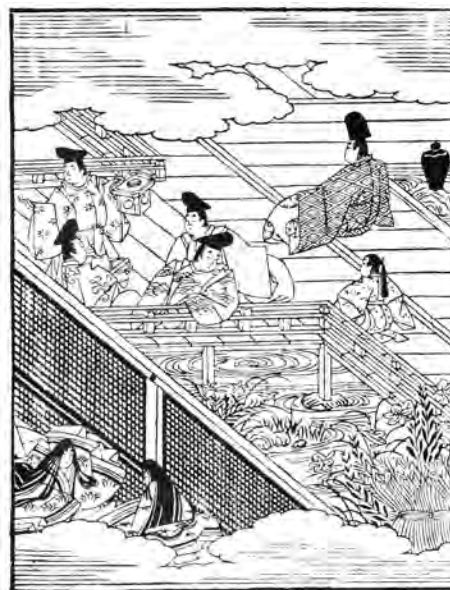
Two illustrations by Mitsuoki Tosa from Chapter 2 of The Tale of Genji.