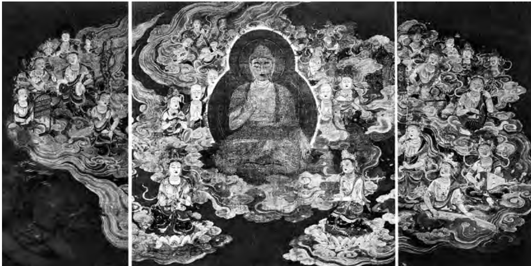
Amida raigō triptych. Late eleventh century. Color on silk; Late Heian period.

Buddhism in Japan was adapted from continental forms to better address Japanese needs. Hōnen's Pure Land school is one good example of this tendency during the late Heian period. Later, other sects with continental Asian roots (such as Zen) were so thoroughly domesticated that they became strongly associated with native culture.