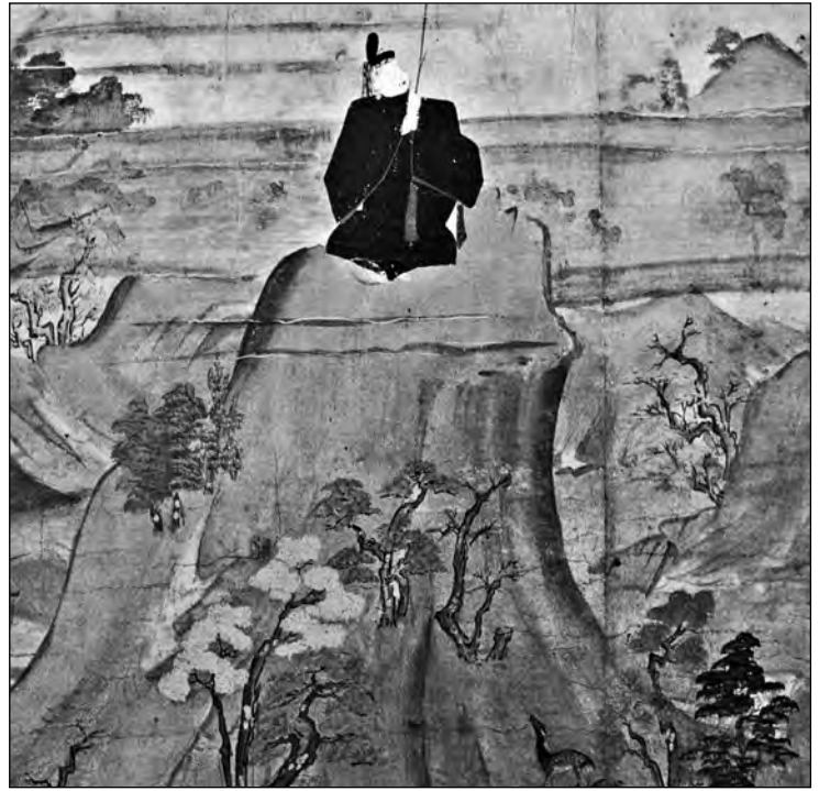
"The Origin of Kitano Tenjin Shrine." (Kitano Tenjin engi emaki). Eight scrolls in color, c. 1219, Kitano Tenmangu, Kyōto. The artist is unknown. Early Sinophile Sugawara no Michizane was sent into exile in part because of the challenge he posed to the Fujiwara regency.

Despite some early resistance, Buddhism in Japan achieved a relatively harmonious coexistence with Shintō, Japan's indigenous system of venerating nature spirits and ancestors. The transmission of Buddhist thought to Japan was expedited by means of a syncretic doctrine that recognized various Shintō deities ( kami ) as local manifestations of the newly introduced foreign buddhas and bodhisattvas.