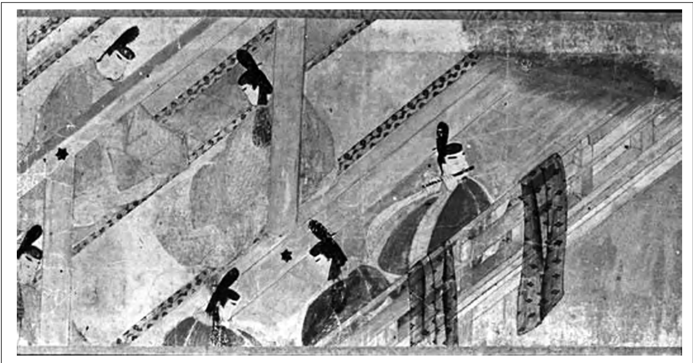
The Genji monogatari emaki ( The Tale of Genji Picture Scroll), dates from the late Heian period. The above image is from Chapter 38: The Bell Cricket.

the same level of training in written Chinese that their male counterparts possessed. The resulting gender divide in literary production is an important theme when examining Heian culture because most of the canonical work from this period was produced by women of the upper social classes.