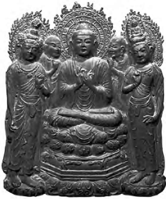
Amida Nyorai, Late Nara, Early Heian Treasure of Saidai-ji, now housed at the Tsurugaoka Hachimangu Museum in Kamakura.