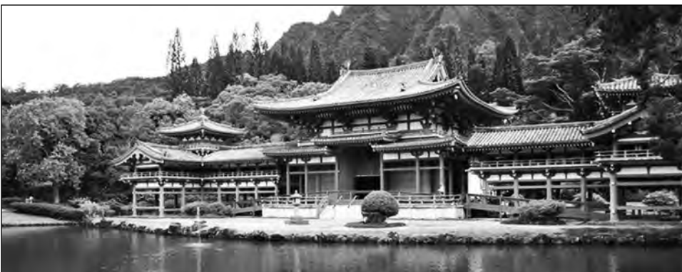
Dating to the year 1052, the Byōdō-in's Phoenix Hall in Uji is one of Japan's best surviving examples of Heian architecture. Originally the villa of Fujiwara no Yorimichi, it was later converted into a Buddhist temple.

Questions useful for exploring the Heian period include the following: How did the Japanese mitigate what were often overwhelmingly powerful cultural influences from the Asian continent to develop a culture and national identity uniquely their own? What gave meaning to the lives of Japanese during the classical age? What lasting cultural legacies can be traced to this pivotal period in Japan's history?