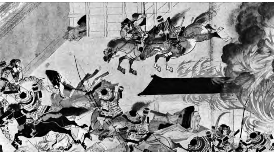
Detail from the illustration Burning of the Sanjo Palace from Heiji Monogatari Emaki (Scrolls of Events of the Heiji), ink and color on paper. Kamakura period, late thirteenth century. Museum of Fine Arts, Boston.

By the late eleventh century, power had begun to pass from the aristocratic classes into the hands of military provincials. The unchecked proliferation of large, tax-exempt landed estates held by provincial officials with military powers under their command set the stage for the decline of the refined and comparatively effete Heian court and the subsequent emergence of the samurai warrior as a central cultural figure. The ascent of the samurai to power was accelerated when open conflict erupted in the mid-twelfth century between a retired emperor and the emperor currently occupying the throne. The repercussions of the initial skirmish would eventually spark the Gempei war (1180–1185), a period of intense disruption and massive destruction within the capital city that culminated in the establishment of the shogunal government in Kamakura and the end of the Heian period in 1185.