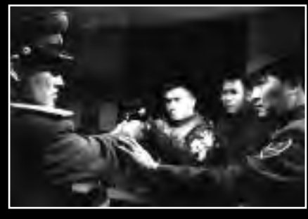
JOINT SECURITY AREA (JSA)

Director: Park Chan-Wook Starring: Song Kang-Ho, Lee Byung-Heon, Lee Young-Ae Color. DVD, 120 minutes, 2002 (U.S. release)