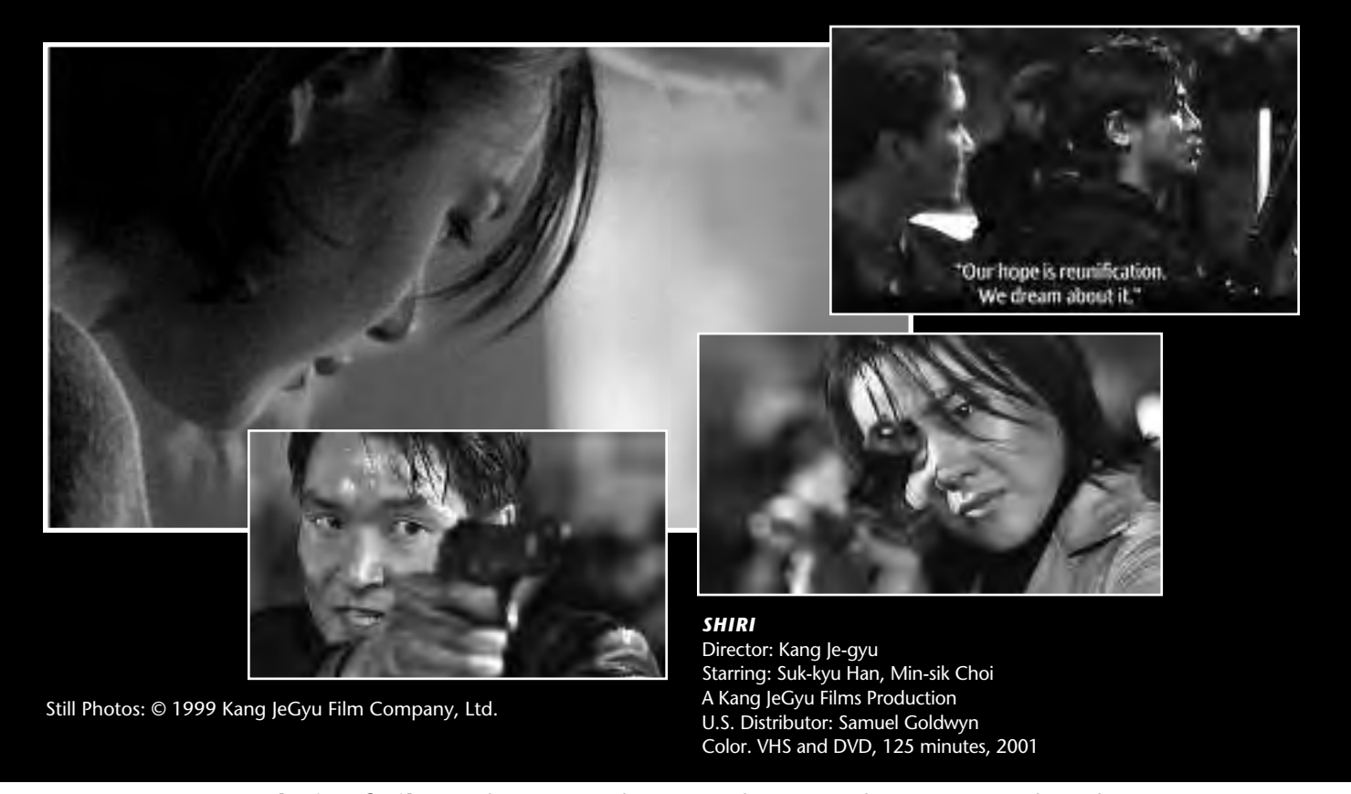
Analysis of Films: This section begins with a story description and analysis of Shiri , then JSA , and ends with a comparison of the two films.