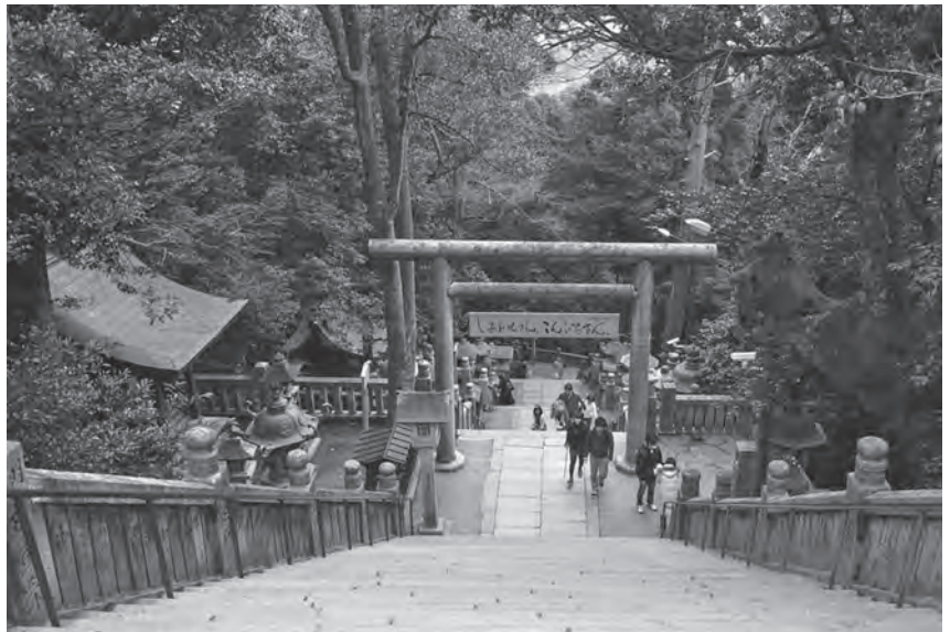
Looking down the 1,368 steps on Mt. Konpira that lead to the Kotohira Shrine.

In February and March 2016, I experienced each of these mountains by completing a pilgrimage in one attempt. Some moments, such as climbing into the clouds of Mt. Unpen with two other pilgrims, were truly magical. “Unpen,” after all, means “near the clouds,” and it was raining intermittently throughout our ascent. This could have been a truly miserable day—not only were we wet and tired, but the rain fell on paths of rock and clay covered by dried leaves that had fallen from the trees. The leaves were slippery, the clay was slippery, and even the rocks were slippery, but climbing up went fairly quickly and relatively well. We emerged from the wooded path into a meadow shrouded in heavy clouds and made our way to the temple, which almost miraculously appeared before us. Coming down was, of course, a different story—each of the three of us fell to the muddy ground at least once during the descent.