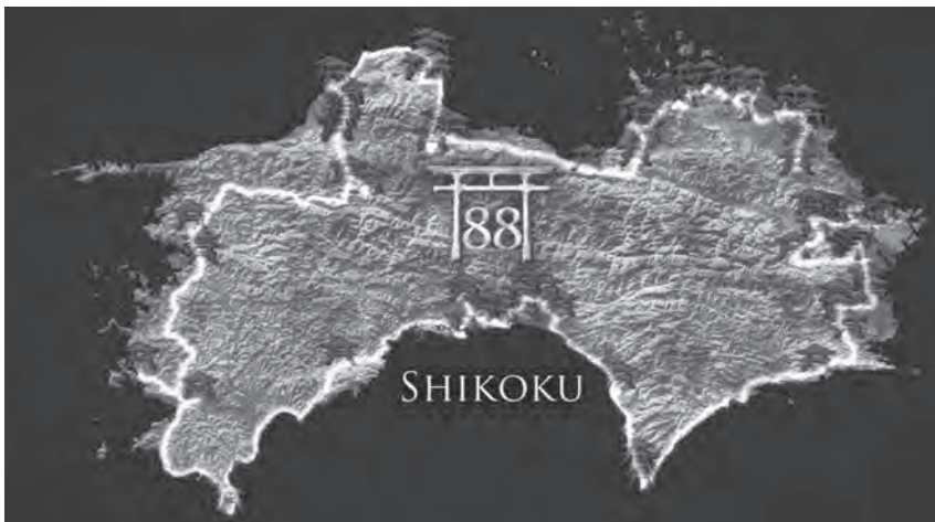
Illustration of Shikoku. The bright white line inside the coastline is the route of the Shikoku Pilgrimage.

largest of the four, spreading across the southern side of the island from end to end. Ehime, once Iyo Province, is in the northwest and is perhaps the most agriculturally rich. Kagawa is the smallest in terms of area, but more densely populated than the other regions. Each of these prefectures has its own character, as well as its own particularly sacred mountains. The four former provinces are, moreover, long tied together by a pilgrimage route connecting eighty-eight sites linked to the life of Kōbō Daishi, one of early Japan’s most revered figures. The temples of the pilgrimage also function as a mandala , or map of the spiritual universe, in this case a spiritual diagram laid over the real physical landscape. One of the most important of the Shingon school of Buddhism’s rituals is chanting the mandala, that is, chanting the mantra (Japanese shingon ) sound specific to each deity represented in the diagram; pilgrims ( henro ) chant (among other things) the mantra of the main deity at each temple they visit, reenacting the ritual across the mandala of the real landscape.