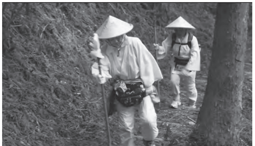
Pilgrims walk a steep mountain path toward a temple.