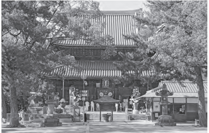
Zentsū-ji Temple number seventy-five, and the birthplace of Kūkai.

Believers undertake these journeys for many reasons. Of course there is a search for good karma and a desire to accumulate spiritual merit, but individuals have other powerful motives as well. Pilgrims may be grieving for lost family members, seeking personal awakening or physical strength, or even trying to avoid a troubling situation at home. In Japanese tradition, such religious discipline is often private, and though family and friends may celebrate the completion of a pilgrimage, there is rarely any other public announcement of the endeavor.