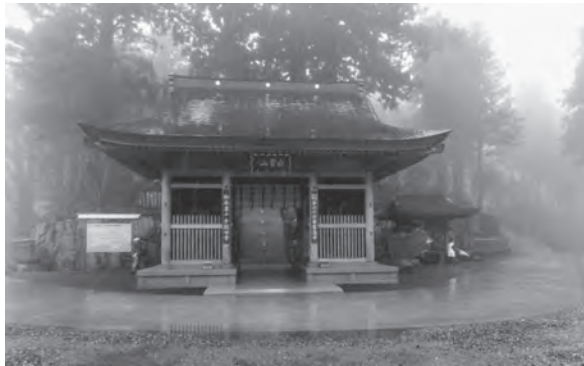
Unpenji gate appearing in the rain.

Traditionally, the journey was accomplished on foot, but today, pilgrims use bicycles, motorcycles, cars, trains, or tour buses.