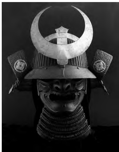
Kabuto, early Edo period.