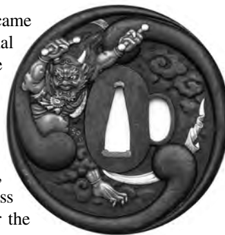
Tsuba (guard). A decorative iron plate at the base of the samurai sword that was meant to protect the swordsman’s hand from the sword of his opponent. Image source: Samurai Warriors by David Miller. St. Martin’s Press, New York, 2000.