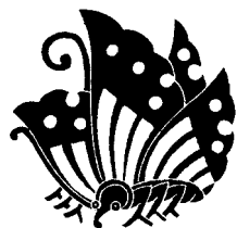
Taira clan crest

Japan's warrior order came into being to serve the imperial court and the noble houses that comprised it as hired swords and contract bows—just one of many byproducts of the broad trend toward the privatization of government functions and delegation of administrative responsibility that distinguished the Heian polity from its Nara era predecessor.