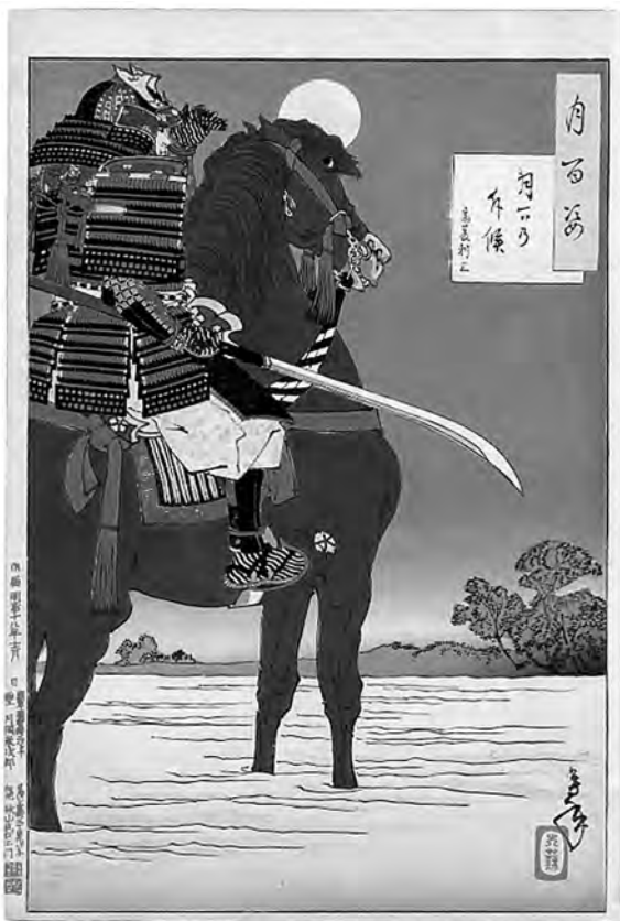
Woodblock print Moonlight Patrol from the series One Hundred Aspects of the Moon by Tsukioka Yoshitoshi (1839–1892). Saitō Toshimitsu scouting along the river Kamo prior to an attack on Honnoji Temple in 1582.

In the course of this so-called Gempei War (the name derives from the Sino-Japanese readings for the characters used to write “Minamoto” and “Taira”), however, Yoritomo revealed himself to be a surprisingly conservative revolutionary. Rather than maintain his independent warrior state in the East, Yoritomo instead negotiated a series of accords that gave permanent status to the Kamakura regime, trading formal court recognition of many of the powers he had seized, for re-incorporation of the East into the court-centered national polity.