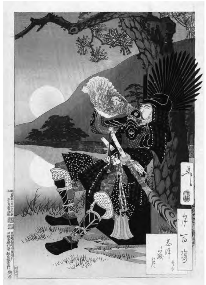
Woodblock print Shizu Peak Moon from the series One Hundred Aspects of the Moon by Tsukioka Yoshitoshi (1839–1892).

The advent of this new polity and the ensuing Pax Tokugawa marked the transition from medieval to early modern Japan, which brought with it profound changes for the samurai. In the medieval age, warriors had constituted a flexible and permeable order defined primarily by their activities as fighting men. At the top of this order stood the daimyō, some of whom were inheritors to family warrior legacies dating back centuries, while others had clawed their way to this status from far humbler beginnings. Below these were multiple layers of lesser lords, enfeofed vassals, and yeoman farmers whose numbers and service as samurai waxed and waned with the fortunes of war and the resources and military needs of the great barons. But the early modern regime froze the social order, drawing for the first time a clear line between peasants, who were registered with and bound to their fields, and samurai, who were removed from their lands and gathered into garrisons in the castle towns of the shogun and the daimyō. The samurai thus became a legally-defined, legally-privileged, hereditary class, consisting of a very few enfeofed lords and a much larger body of stipended retainers,