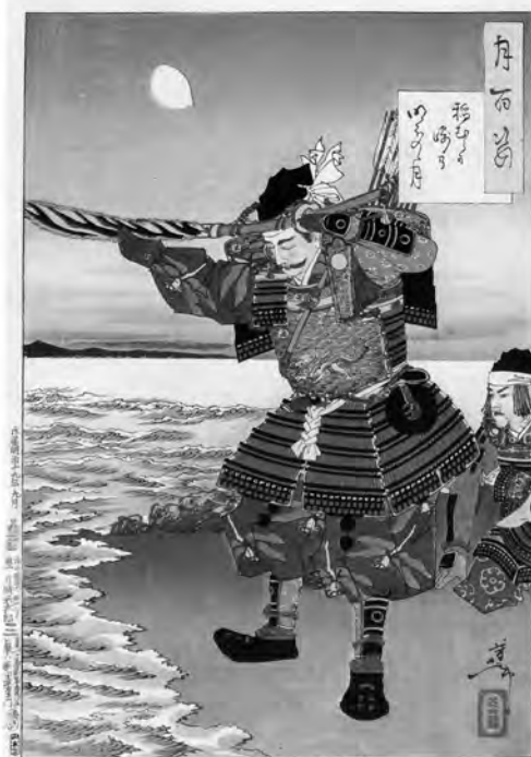
Woodblock print Inamura Promontory Moon at Daybreak from the series One Hundred Aspects of the Moon by Tsukioka Yoshitoshi (1839–1892). Depicts General Nitta Yoshisada (1301–1338) as he prayed to the sea gods for assistance before a battle.

These competing obligations led the shogunate to adopt a policy of minimal action whenever it was called upon to resolve a dispute between one of its vassals and some court noble or temple. It never acted unless asked (by one or both of the parties involved), kept no