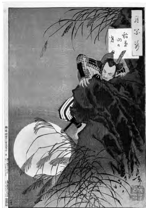
Woodblock print Inaba Mountain Moon from the series One Hundred Aspects of the Moon by Tsukioka Yoshitoshi (1839–1892).

In 1331 Kamakura discovered that Go-Daigo had been plotting its elimination, and responded by forcing his abdication, and later his exile to the remote province of Oki. At this, Emperor Kōgon, of the Senior line, ascended the throne. In the second month of 1333, however, Go-Daigo escaped from Oki and took refuge with supporters, who had continued to be active in working against the shogunate. Kamakura responded by dispatching armies under Ashikaga Takauji and Niita Yoshisada to subdue the “loyalist” forces and recapture Go-Daigo. But in mid-course, both commanders turned on the shogunate, Takauji attacking and destroying its offices in Kyoto, and Yoshisada marching on Kamakura itself. In the sixth month of 1333, Go-Daigo returned to Kyoto, insisting that he had never formally abdicated, and proclaimed the start of a Kemmu (again named for the calendar era) Restoration of imperial rule. Within three years, however, he found himself once again driven from power, by the very men who put him there.