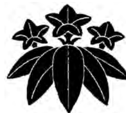
Minamoto clan crest