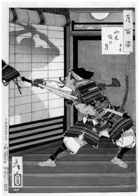
Woodblock print Moon at the Yamaki Mansion from the series One Hundred Aspects of the Moon by Tsukioka Yoshitoshi (1839–1892).

The imperial state military system had been designed in the late seventh century, in the face of internal challenges to the sovereignty of the court and the regime, and the growing might of T'ang China, which had been engaged since the early 600s in one of the greatest military expansions in Chinese history. The architects of the new polity seized on large-scale, direct mobilization of the peasantry as a key part of the answer to both threats, creating a militia system that made all free male subjects between the ages of 20 and 59, other than rank-holding nobles and individuals who “suffered from long-term illness or were otherwise unfit for military duty,” liable for induction as soldiers. 3 But while this military structure was more than adequate to the tasks for which it was designed, by the middle decades of the eighth century, the political climate—domestic and foreign—had changed enough to render the system anachronistic and superfluous in most of the country.