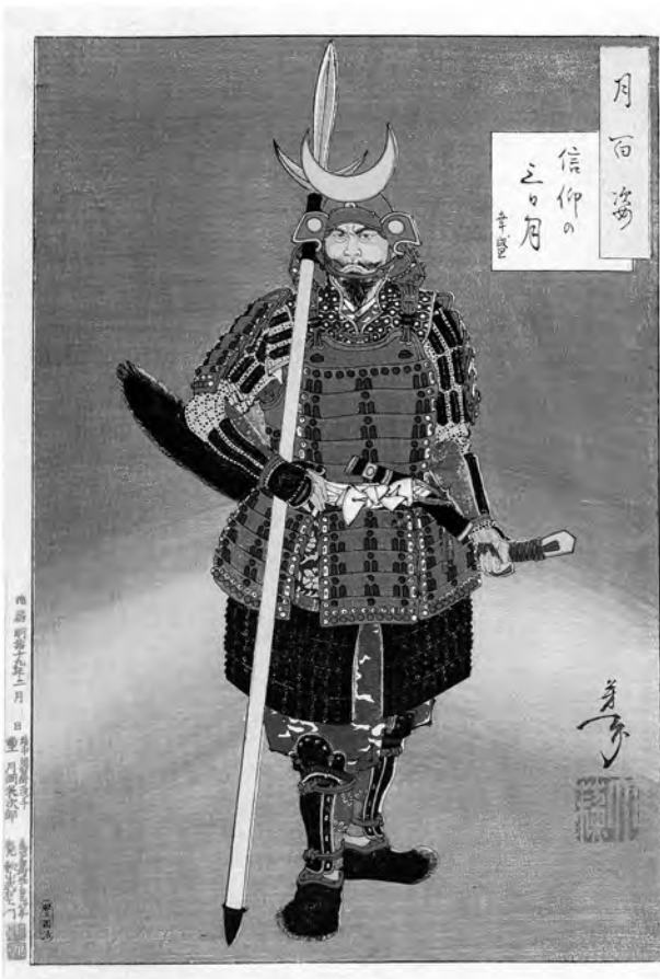
Woodblock print Faith in the Third-Day Moon from the series One Hundred Aspects of the Moon by Tsukioka Yoshitoshi (1839–1892). A portrait of the general Yamanaka Kikanosuke Yukimori in full armor. The “three-day moon” crest on his helmet.

whose numbers were now fixed by law. And, without wars to fight, the military skills and culture of this class inevitably atrophied. The samurai rapidly evolved from sword-wielding warriors to sword-bearing bureaucrats descended from warriors.