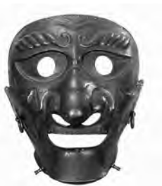
Samurai Iron Somen Face Mask, c. 1800–1868.