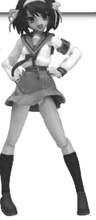
Plastic toy of Haruhi Suzumiya from the Japanese TV series anime, The Melancholy of Haruhi Suzumiya .

Many psychologists and cultural critics argue that the roots of otaku behavior lay within Japan's highly structured, even oppressive, educational and social systems.