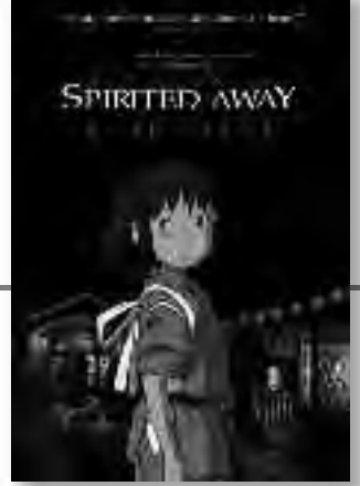
Promotional poster for Spirited Away .