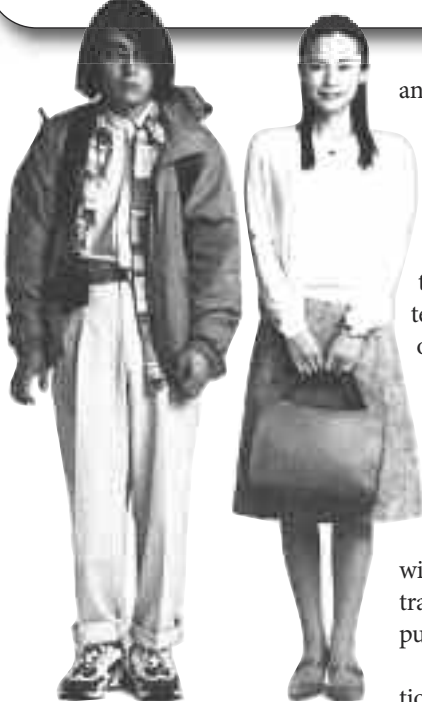
Promotional photo for Densha otoko (Train Man)