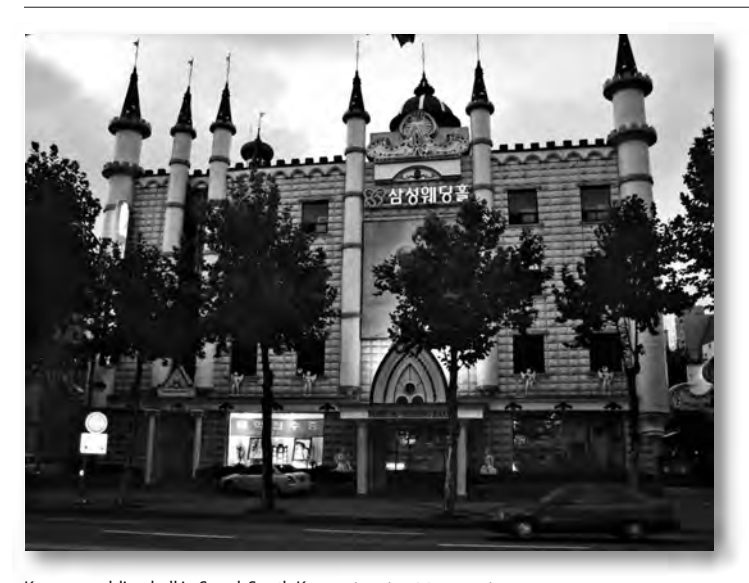
Korean wedding hall in Seoul, South Korea.

... frequently articulated tensions between "old-style" versus "new" or "modern," "Korean tradition" versus "Western," rural/domestic versus commercial service industry, bore out my supposition that wedding rituals were an excellent lens through which to examine larger social trends, . . .