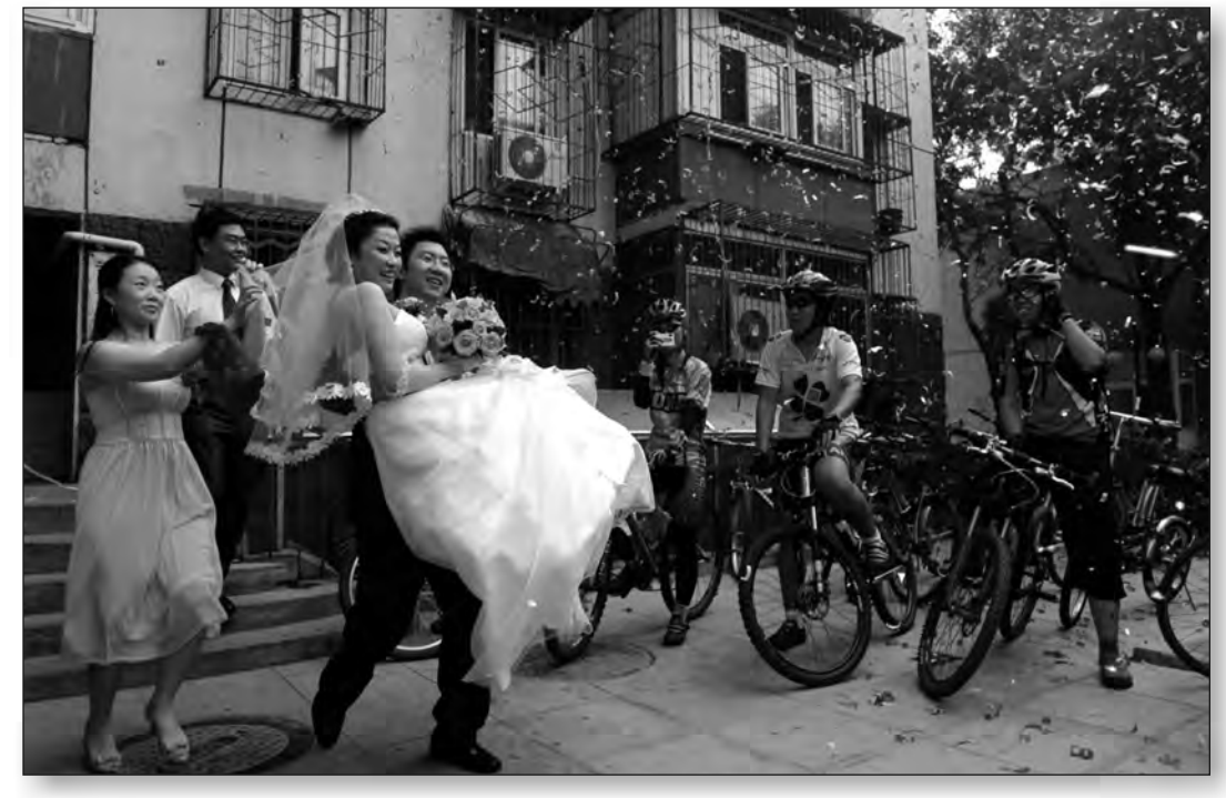
Contemportary Chinese bride and groom celebrating their wedding.

South Korea is not unique. Rural bachelors in northern Japan have sought Filipina brides for several decades, and today, the bordercrossing bride is a frequent traveler, crisscrossing the map of Asia amid other migrations brought about by globalization. Nicole Constable argues that these marriages are both quantitatively and qualitatively different from anything that has gone before, aided by faster and more widely available transportation, telephones, and the Internet.19 Women from the Hakka-speaking community in Calcutta seek brides from their ancestral village in Guangdong Province, China for Hakka bachelors back in India; Hmong men in the US whose fami-