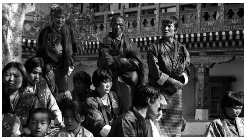
Audience in their best national dress (kira and gho) at Punaka festival historical reenactment.