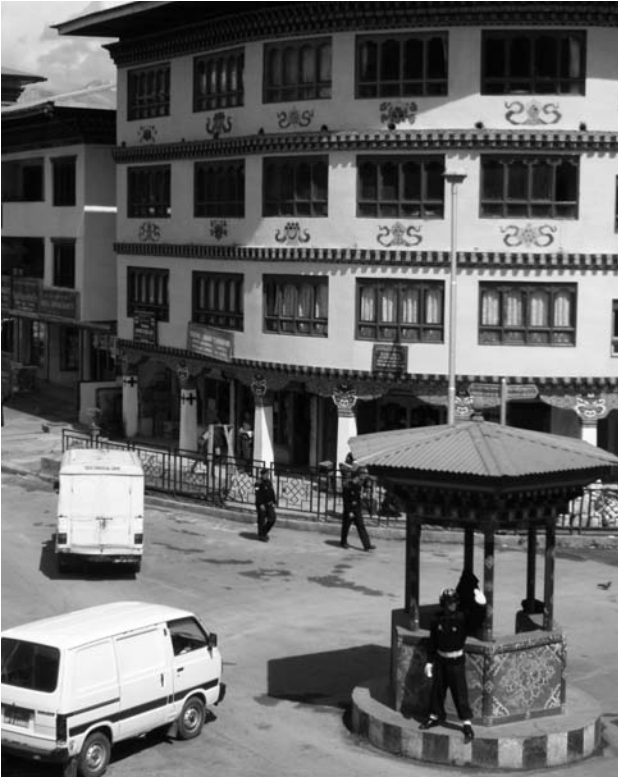
The central intersection in downtown Thimphu, with police directing traffic instead of a traffic light.

The most recent and only reliable census taken as a total count in 2005 revealed that Bhutan’s population is slightly less than 700,000. Males slightly outnumber females in each of the major age categories, though not to the extent recorded in China or India, and population increase is slow, which is typical for cold climates. 7 Females officially receive equal legal protection and hold employment in many fields. Only 35 percent of the population lives in urban areas.