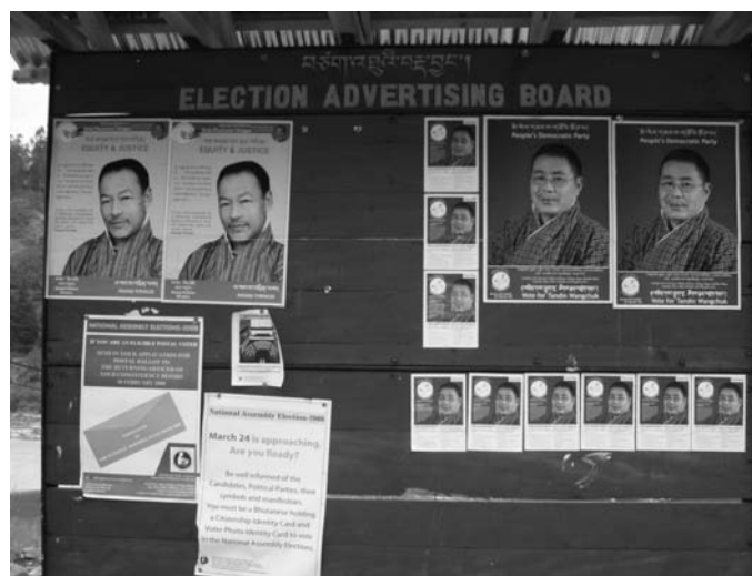
Election poster board advertising candidates campaigning in Bhutan's first election for the new Parliament.

The end of World War II brought a turbulent sorting out of regional national boundaries. China invaded Tibet in 1949, pushing an alarmed India and Bhutan into a "protectorate" treaty. By 1958, India's Prime Minister Nehru and his daughter, future Prime Minister Indira Gandhi, trekked on mule-back to Bhutan, pledging support for improved infrastructure and political-economic