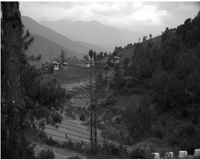
Typical rural setting with small farm dwellings and their steeply terraced hillside fields of rice or barley with higher Himalayan ranges in background.

Migration to larger cities, such as the capital of Thimphu, is increasing, as people seek and obtain primarily government jobs. However, migration is officially discouraged in order to avoid overpopulation in urban areas that is a common blight of developing countries. Rather, the Bhutanese government is attempting improvement of rural livelihood and income opportunities. With the advent of the Internet and television in the last decade, this policy has proved harder to enforce. Viewers with access to such communication technology aspire to enjoy the higher standard of living apparent in the images they see, available only in an urban setting. Although substandard dwellings are torn down, many migrants rely on the tight social network to find at least temporary housing with city-dwelling relatives.