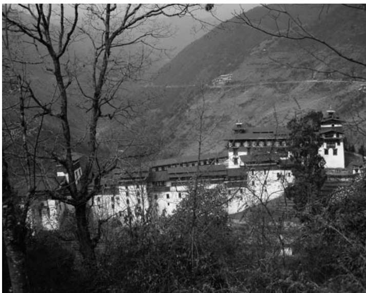
Traditional Dzong, a combination of a fort and monastery, representing the secular body and military force along with the religious protective authority on the outskirts high above a town.

The widely divergent, contemporary political situation of the Himalayan countries of Bhutan, Nepal, Sikkim, and Tibet reflects a culturally and historically produced set of outcomes not dissimilar to the European Alpine nations of Austria, Germany, Italy, and Switzerland. Ranging from continued independence and self-imposed semi-isolation (Switzerland is not a member of the European Union) to absorption in whole or in part by bigger neighbors, political leadership choices led to momentous twenty-first century consequences. Nepal