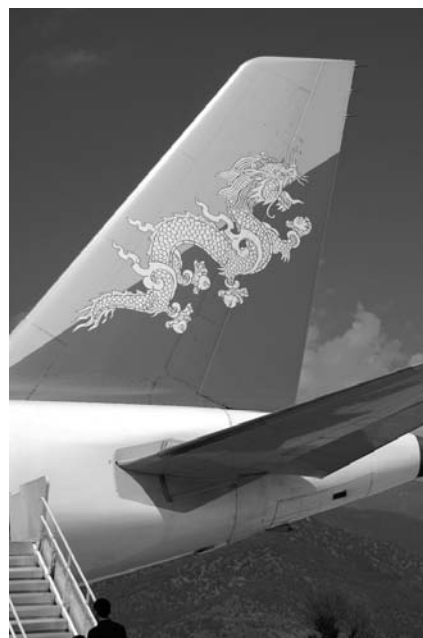
An airplane tail, one of two in the fleet of Druk Airlines based on the national flag, displaying the white "Thunder Dragon," with the yellow top signifying the secular authority of the king and the orange bottom the religious tradition of Buddhism.

Although rooted in Buddhist beliefs, GNH has inspired much international interest and discussion concerning its qualitative and quantitative measurability and subcategories such as physical, mental, and spiritual health; time balance attainment, sociocultural and ecological vitality, education, and living standard satisfaction are related categories. Assessment of GNH levels might be theoretically possible with data provided through international development agencies for such "quality of life" categories as infant and maternal mortality, longevity, and school completion rates for both genders. Joining international organizations such as the United Nations and receiving grants from agencies such as the World Bank and Asian Development Bank (ADB) are vital to Bhutan's development plans to lessen reliance on India without diminishing the importance of those ties.