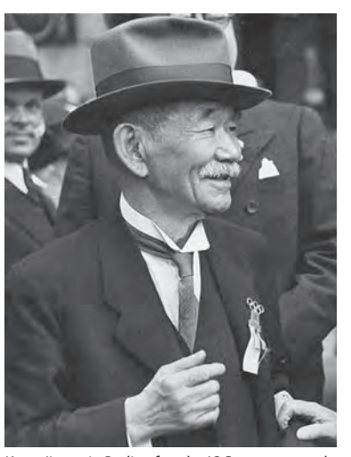
Kanō Jigorō in Berlin after the IOC vote to award the 1940 Olympics to Tokyo (July 31, 1936).

Games took on a greater significance in the public imagination. In order to position itself on more equal footing with powerful European nations such as France, England, and Germany, Japan set its sights on hosting the Olympics. The year 1940 coincided with a huge commemoration, the alleged 2,600th anniversary of the founding of Japan, according to the eighth-century chronicle Nihon Shoki. In 1936, shortly before the Berlin Olympics, the IOC announced that Tokyo had won the bid to host the 1940 Games. Japanese fans eagerly followed the Berlin Olympics, where the Japanese delegation did very respectably, capturing six gold and