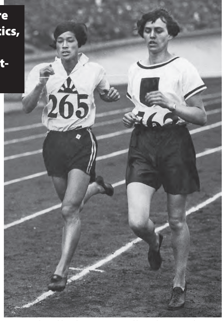
Hitomi Kinue, silver medalist in the women's 800-meter athletics at the 1928 Amsterdam Olympic Games, with Lina Radke, gold medalist.

As fervent nationalism fed into a desire to perform better, and as performing better fed into the fervent nationalism of the early 1930s, the Olympic