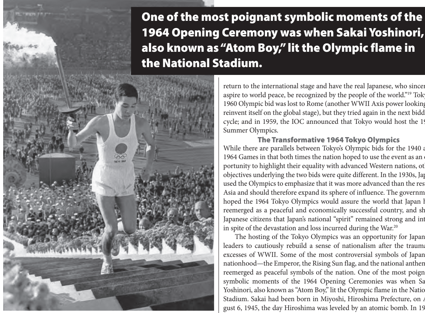
Sakai Yoshinori at the 1964 Olympics Opening Ceremony.

In stark contrast to the glory and pride on display at the 1936 Olympics, in the late 1930s, Japanese military and political leaders were marching the nation into one of the darkest periods of modern Japanese history. Japanese aggression and Imperial control were spreading throughout Asia. In 1937, the year after the Berlin Olympics, Japanese forces killed hundreds of thousands of Chinese civilians in the infamous Nanjing Massacre. Japanese aggression would likely have led to some nations boycotting the Tokyo Olympics. However, it was the cost of pursuing the full-scale "holy war" with China that led the Japanese in 1938 to forfeit hosting the 1940