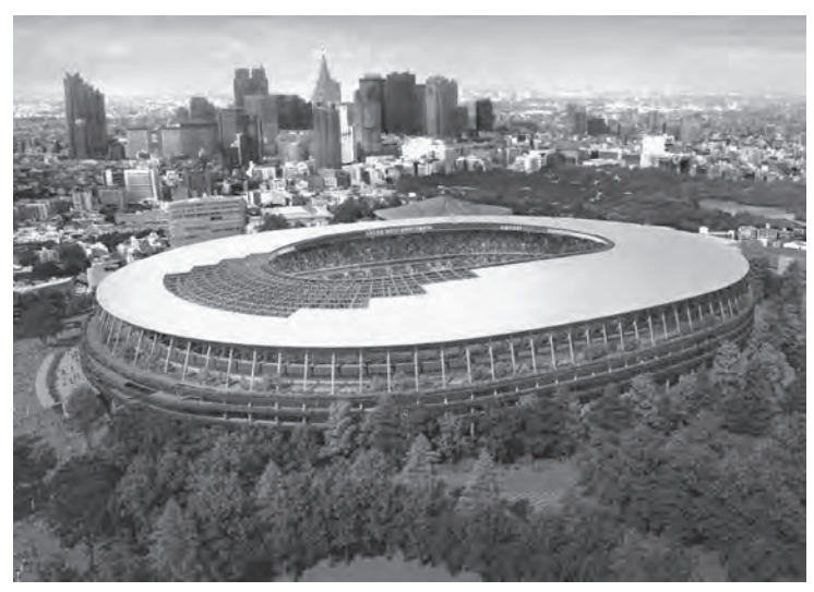
The final stadium design for the 2020 Olympics was announced on December 22, 2015. Japanese officials selected a wooden lattice design by Kengo Kuma for the new National Stadium in Tokyo, which will be the centerpiece for the 2020 Olympics.