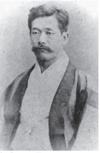
Kanō Jigorō at age 28.