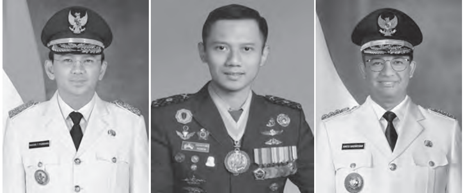
The 2017 candidates (left to right): Incumbent Basuki Tjahaja Purnama (Ahok), Agus Yudhoyono, and the eventual winner, Anies Baswedan.

Of course, not everyone agreed with his decisions. Some residents of riverbanks refused to be relocated to public housing when they were required to clear up the space to normalize rivers, while fishermen protested his reclamation plans in the Bay of Jakarta. Politically, Ahok faced opposition from groups who were not welcoming of the changes he proposed. Notable is, for instance, Ahok's dispute with the Jakarta City Council,