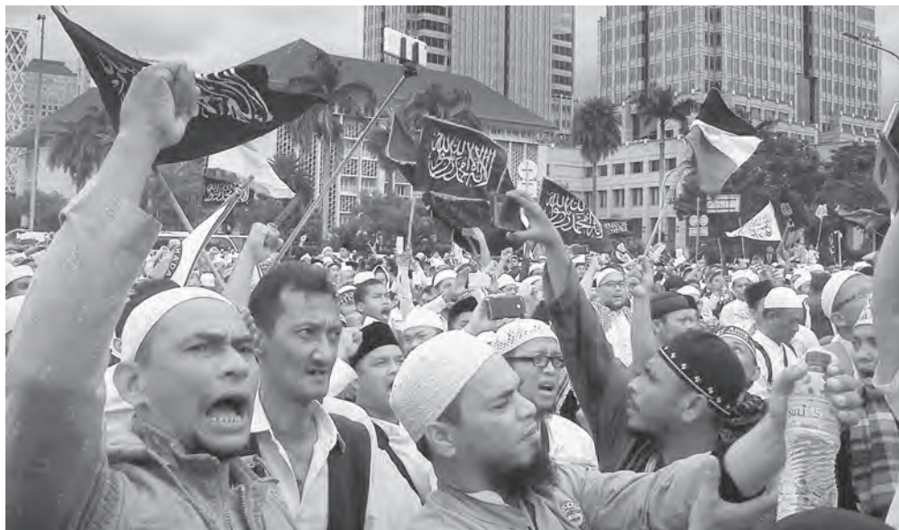
Islamist protests against Ahok in Jakarta, March 2017.

The convergence of religious conservatism and political opportunism proved to be mightily effective in steering the public discourse.