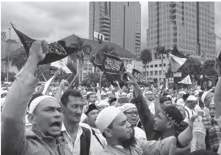
Protests against Ahok in Jakarta in March 2017.

Indonesian President Jokowi Widodo—who was formerly Governor of Jakarta with Ahok as his Deputy Governor—issued a presidential directive banning Hizbut Tahrir for going against “national unity and the Indonesian nation.” 7 Hizbut Tahrir favors the implementation of sharia law and the establishment of an Islamic caliphate. The new directive allows the government to ban other organizations in the future and may have been aimed at coercing the Islamic Defenders Front to calm its actions and rhetoric to preserve the country’s peace.