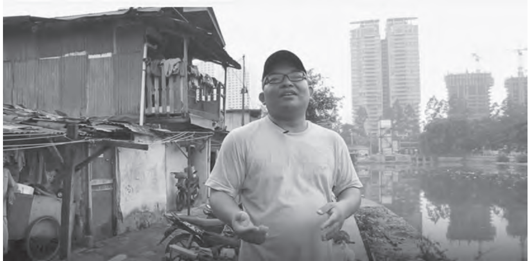
A resident of the slums behind the Jakarta high-rises talks about the huge gap between the rich and the poor.

However, the youth bulge also presents challenges to the government. It is not just a demographic bonus, but also a call to action. Indonesia's schools and universities must not only educate more young people but do a better job. Indonesia finds itself in a region of star performers in education; Shanghai-China, Singapore, Japan, Taiwan, and South Korea all finish high in the Organization for Economic Co-operation and Development's Program for International Student Assessment (PISA) test rankings, which test hundreds of thousands of fifteen-year-olds in dozens of countries in math, reading, and science. Indonesia's education system has problems from the primary level to the university level. At the primary level, low pay and remote postings have led to staff shortages and poor-quality teachers. 15 The PISA tests measure education at the secondary level, and Indonesia regularly finishes at or near the bottom of the PISA league tables, sixty-ninth out of seventy-six countries in 2015. At the university level, corruption, lack of funding for research, and not enough faculty with doctorates hinder quality. None of Indonesia's universities break the top 200 ranking globally.