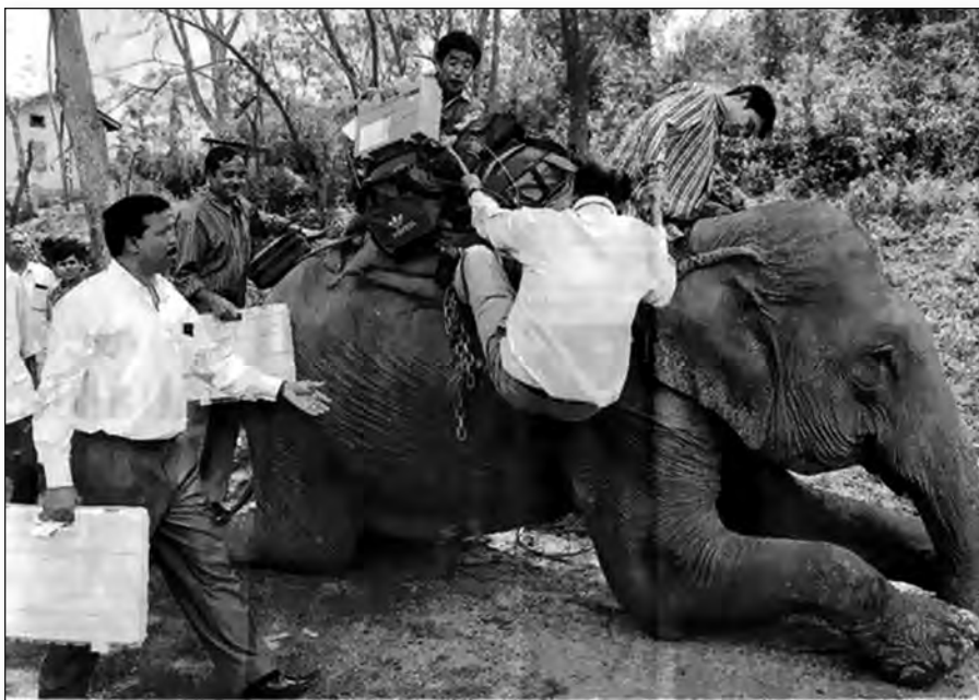
The photo caption: A MAMMOTH TASK: An election official climbing onto an elephant on his way to duty at Nartap in the Guwahati constituency on the Assam-Maghalaya border. Elephants, horses and country boats are being used for carrying the electronic voting machines and other material to the remote areas of Assam. Election is being held for six Lok Sabha seats in the first phase on Tuesday in the northeastern State.

The absence of a military coup, or even the threat of one, is one explanation for why India remains a democracy.