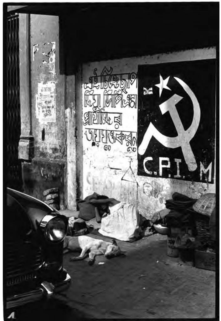
Man and dog sleeping under a 1980 election-time wall poster of the CPI(M).

On polling days, the Election Commission has full authority to mobilize government employees, such as teachers and security forces, to conduct the election. Most elections have violent incidents, including murdering candidates and ballot box stuffing. These occurrences have declined in recent years, however, as security has tightened; polling is on multiple days for up to a month. In cases where an election has been "countermanded," a fresh poll is held weeks later, with additional security—and invariably there is no further problem. Vote fraud still exists in a few areas, but even then affects only a small percent of the vote total. All voting is on Indian-designed and Indian-manufactured electronic machines. This has accelerated the vote count results, but even before these technological advances, elaborate pro-