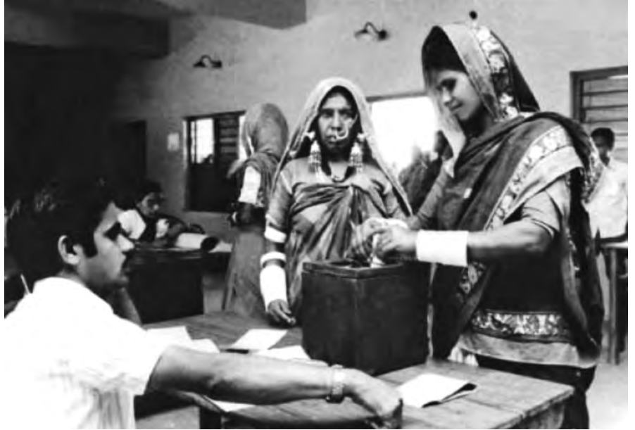
Tribal women casting their vote in Andhra Pradesh.

using such tools as demonstrations and litigation, but they usually steer clear of electoral politics. The rich, and even the urban middle classes, manage to advance and protect their interests in large measure through networks of kinship and common institutions, such as schools and colleges, social clubs, and professional associations. This form of interest-group politics by well-positioned groups is typical of not only India, but of all democracies.