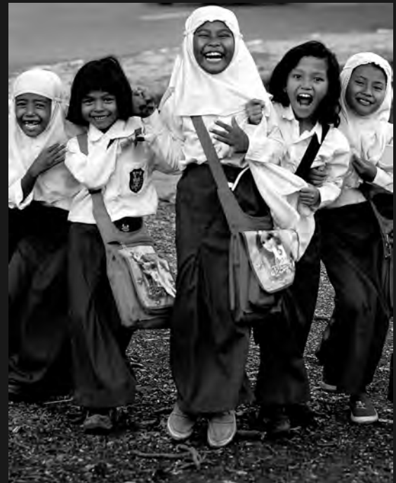
School is Out, May 9, 2005 Students at a primary school in Banda Aceh are smiling at the end of the day.