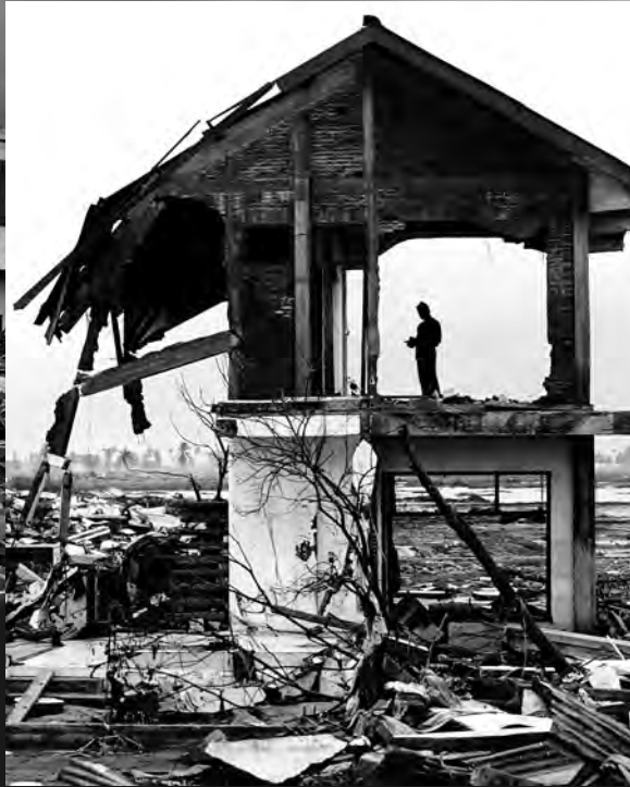
Remnants , January 14, 2005 A man rummages on the second floor of a destroyed home in Banda Aceh.