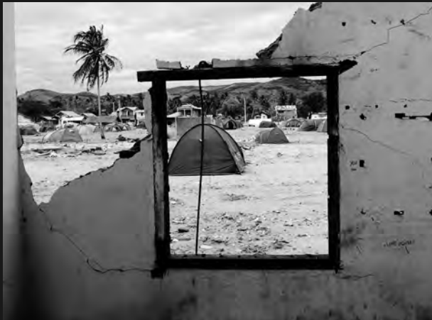
Temporary Housing, May 7, 2005 Scattered tents provide housing for many of the homeless in the port town of Krueng Raya.