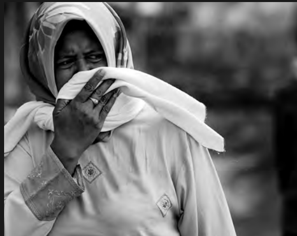
Passing by Mass Grave 1 , January 15, 2005 A woman walks past a small mass grave in the business district of Merduati in Banda Aceh.