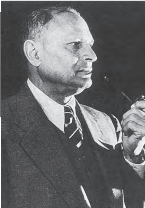
Portrait of Guru Dutt Sondhi.