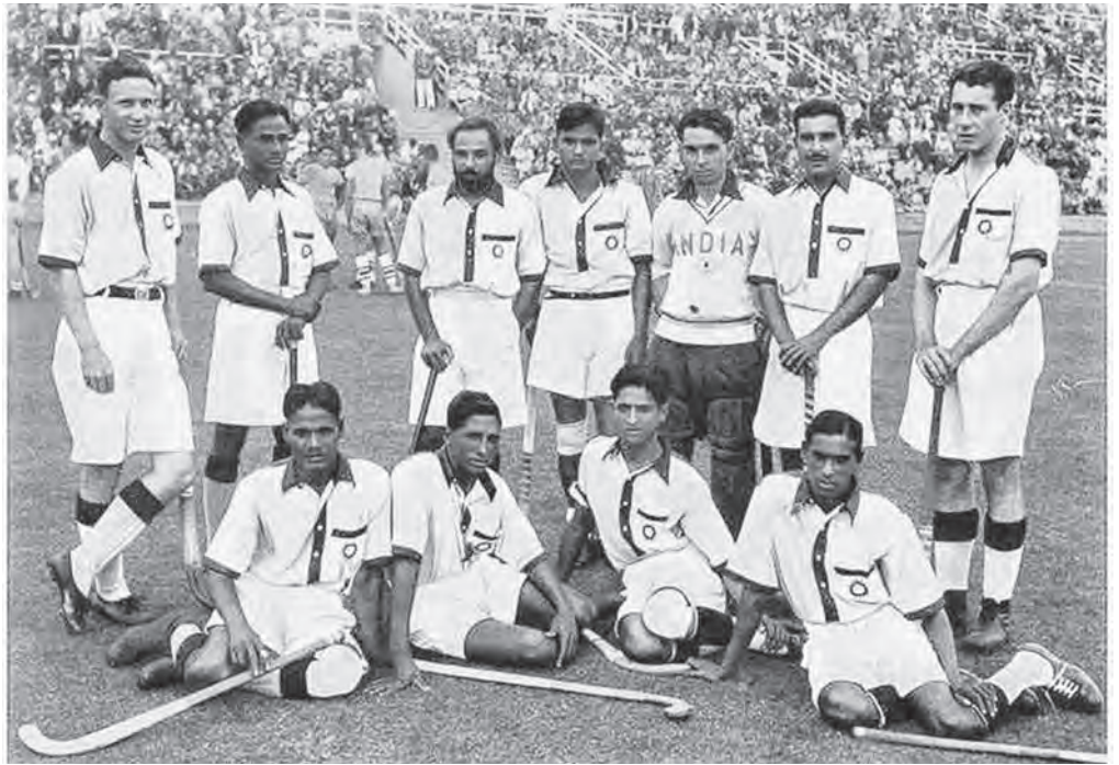
India's 1936 field hockey team, captained by hockey wizard Dhyan Chand (standing second from left), was the gold medal winner at the 1936 Berlin Summer Olympics.

Source: Wikipedia at http://tinyurl.com/zsfh6r4 .