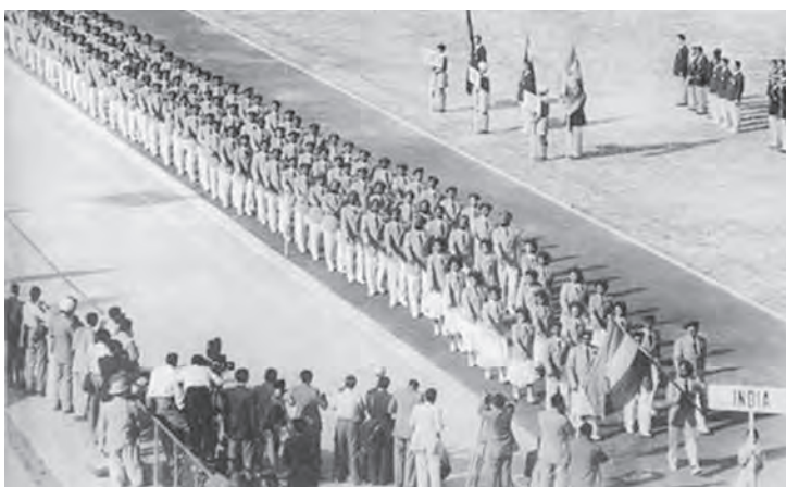
Indian athletes marching through the National Stadium during the opening ceremony of the First Asian Games, held in New Delhi, India.

Encouraging internationalism and peaceful Asian cooperation remained his central desire. At an Asian Games Federation meeting in October 1957, he was still affected by the “Sputnik Shock” that