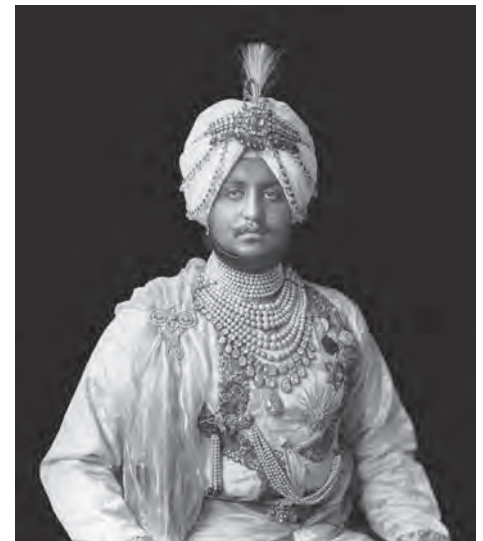
Portrait of Maharaja Bhupinder Singh of Patiala.