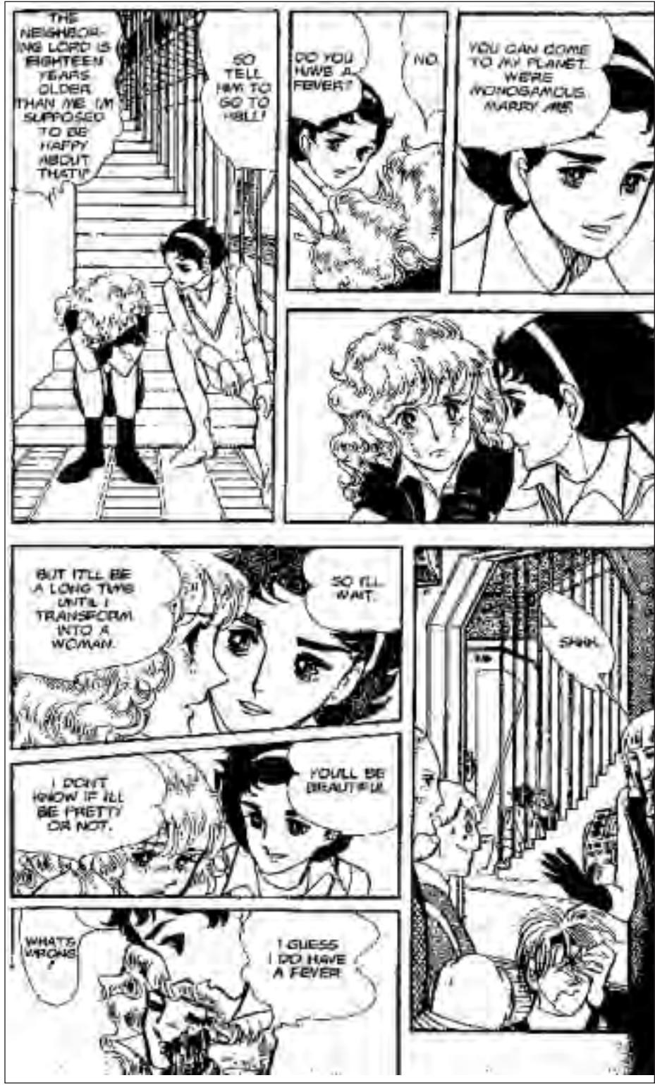
Page titled: A sweet moment between Tada and Frol (overheard by the rest of the group!).

When I began teaching a course on Japanese popular culture, I was drawn to Japanese animation as a potential resource for teaching about Japanese culture and society. I have screened They Were 11 and Princess Mononoke for the "gender troubles" week of my course, and the opinions and insights of my students are incorporated into the discussion of these films presented below. Both films are relatively easy to rent or purchase in VHS format.<sup>4</sup> Neither film contains explicit sexual situations. There is virtually no violence in They Were 11. Princess Mononoke, however, was rated PG-13 by the MPAA when released in the United States and does include a few graphic battle scenes, including one where Prince Ashitaka's supernaturally propelled arrow amputates both arms of a samurai looter and decapitates another, as well as raw and unsani-