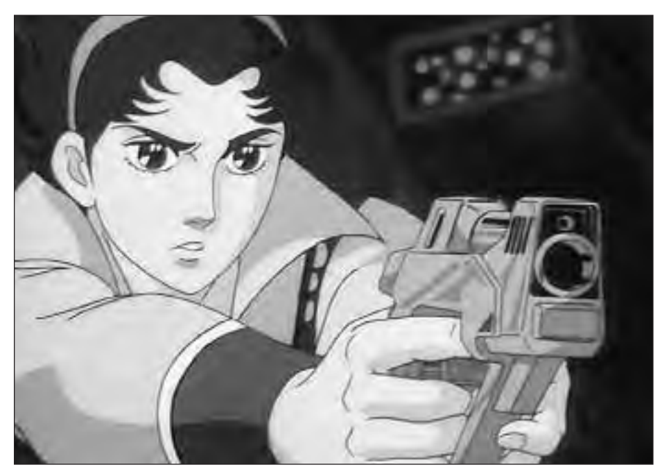
Tada, sure enough, is far from a specimen of macho hunk and is rendered throughout the film as one of the more feminine-looking characters. Image source: Gary's They Were 11 Website. http://www.inetres.com/gp/anime/tw11/index2.html

Image source: Gary's They Were 11 Website. http://www.inetres.com/gp/anime/tw11/index2.html