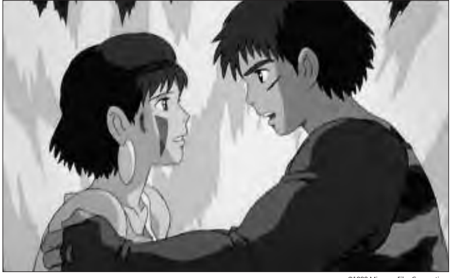
Ashitaka and San.