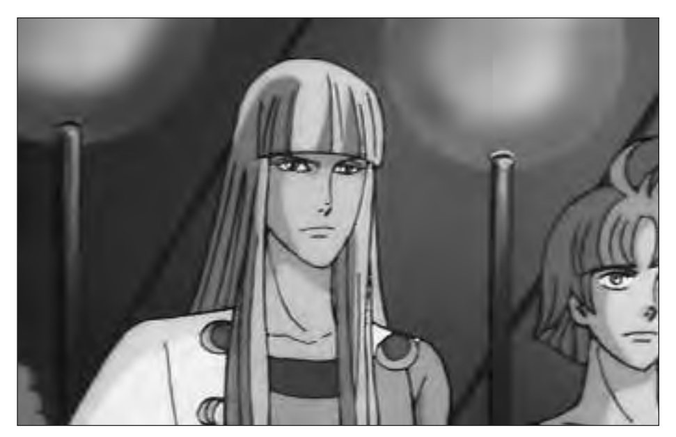
Frol is not the only "feminine-looking" character in the film. Following the conventions of girl's comics that are alluded to above, King Mayan Baceska, for instance, possesses waist-length, straight, light blue hair, sharp, narrow, Modigliani-inspired facial features, willowy frame, and other qualities that may signal femininity to American viewers.

Frol is not the only "feminine-looking" character in the film. Following the conventions of girl's comics that are alluded to above, King Mayan Baceska, for instance, possesses waist-length, straight, light blue hair, sharp, narrow, Modigliani-inspired facial features, willowy frame, and other qualities that may signal femininity to American viewers. This is partly explained by the fact that, in Japanese girl's comics, male characters tend to be illustrated in a markedly feminine manner. In terms of identifying the gender of animated characters in Japanese anime, voices are sometimes more helpful than visual cues. However, gender stereotypes are tweaked throughout the film in other ways as well. Ganga, the most masculine-looking character of the bunch, with tanned bronze skin, deep bass voice and stocky, muscular body, is depicted as the most nurturing character, closely identified with the healing process (he is a pre-med student) and "giving birth" to the antiviral