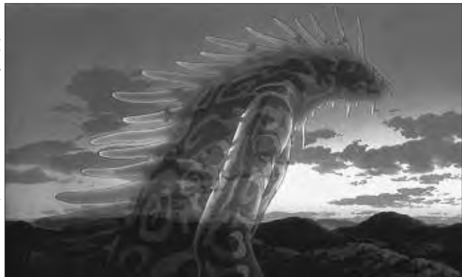
The transformation of the Deer God into the vengeful forest spirit.