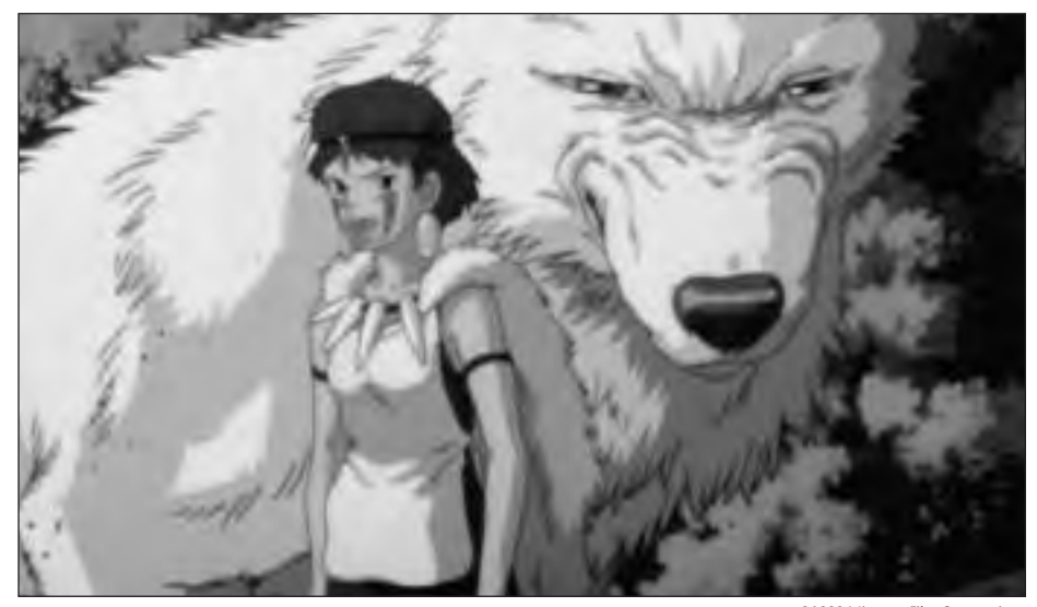
San (Princess Mononoke) and Moro.

Where They Were 11 is a cerebral and genteel chamber piece, Princess Mononoke is a grandiose symphonic score, full of heavenly choral passages and savage blaring of horns and trumpets.