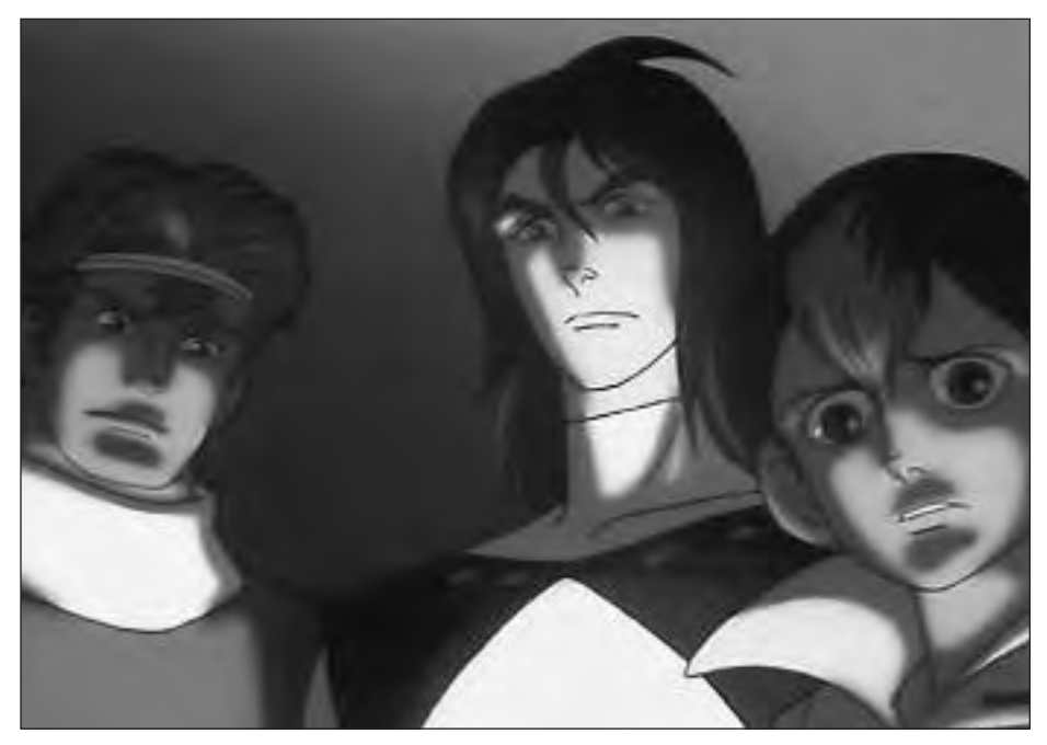
Ganga, Amazon and Toto. Image source: Gary's They Were 11 Website. http://www.inetres.com/gp/anime/tw11/index2.html

Image source: Gary's They Were 11 Website. http://www.inetres.com/gp/anime/tw11/index2.html