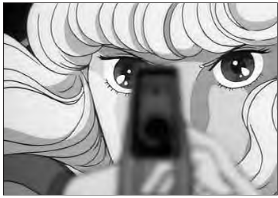
When Frol is first introduced, most other characters take "her" for a young woman, given "her" flowing curls of blond hair, red lips, violet eyes and "delicate" body shape.