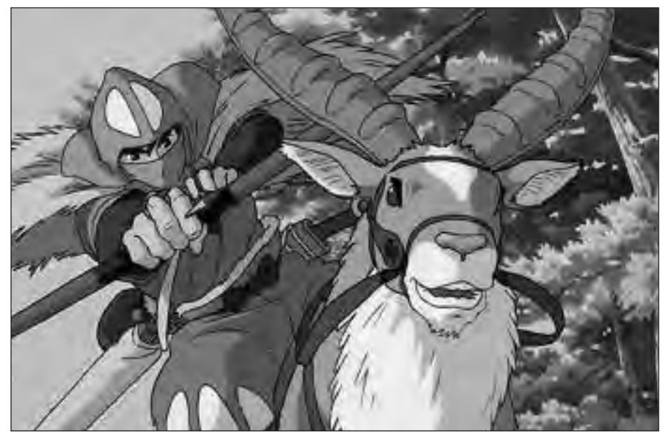
Ashitaka and Yakkul.

The film's thematic conflict between nature and civilization is distilled in the struggle between San and Eboshi. This particular pattern of antagonism between two strong, willful female characters, one a young girl and the other an adult woman, is not an innovation introduced in Princess Mononoke . It also drives the narrative in Miyazaki's earlier work, Nausi caa in the Valley of the Winds .<sup>11</sup> In Nausi caa , the heroine, a spunky and pure-hearted teenage princess of a desert kingdom, is pitted against Kushana, the unflappable queen of a neighboring country. Kushana