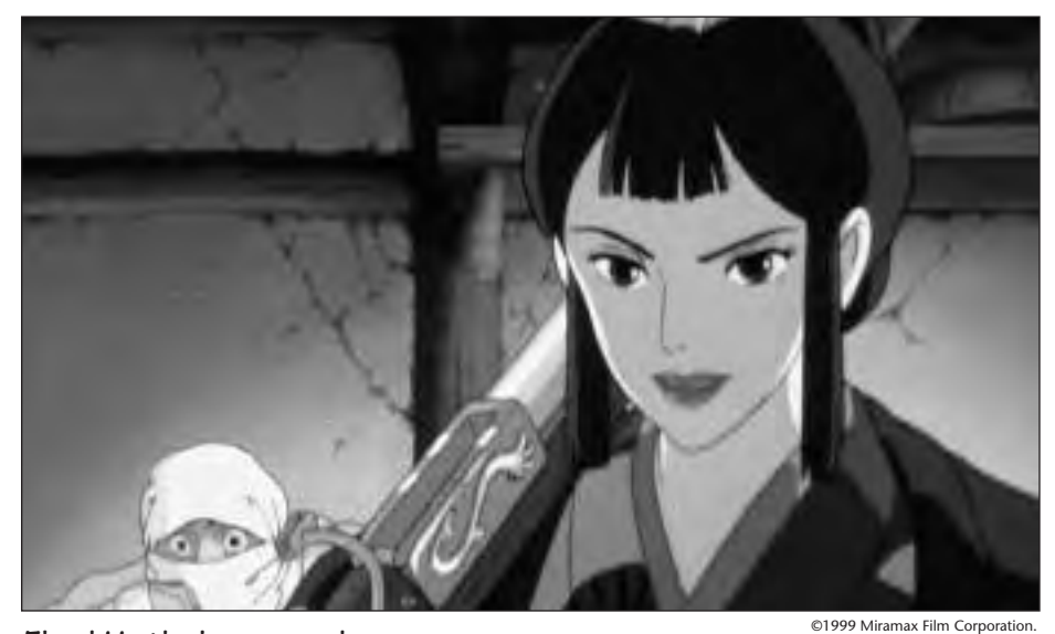
Eboshi in the leper gun shop.

©1997 Tokuma Shoten Publishing Company, Ltd.