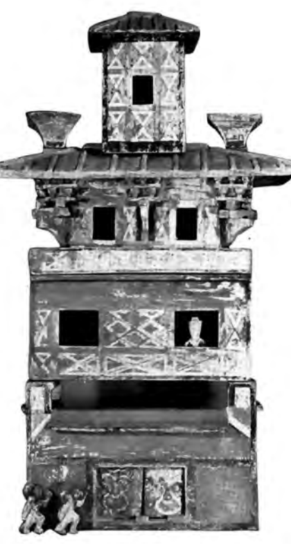
A Chinese pottery tower from the Han dynasty.

Not only did military expertise have a heightened prestige in this period, but members of the upper class were often connected through voluntary ties. These ties took three principal forms: current subordinates,