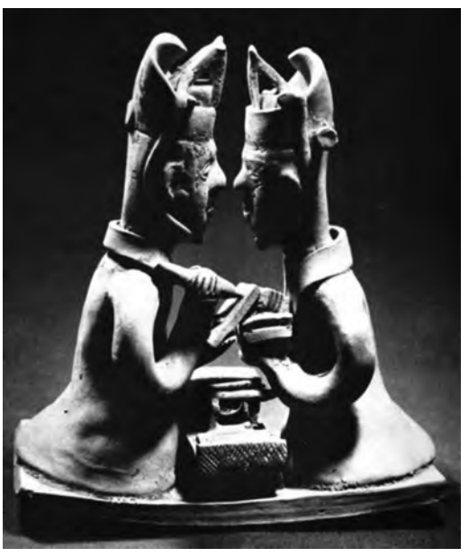
Two Chinese scholars collating texts. Pottery figures from the Eastern Jin dynasty (317–420).

Like their Chinese counterparts, these regimes were cultural hybrids. Similar to the Inner Eurasians who swept into northern China, Bedouins from the Arabian steppe allowed submissive localities to retain their original leadership and religions. Greek and Persian administrators retained their jobs and merely reported to Arab overlords. Urbanized Arabs soon assimilated into the culture of the city in which they lived; for example, those living in Persia soon spoke Persian and wore Persian clothes. Non-Arabs soon made their