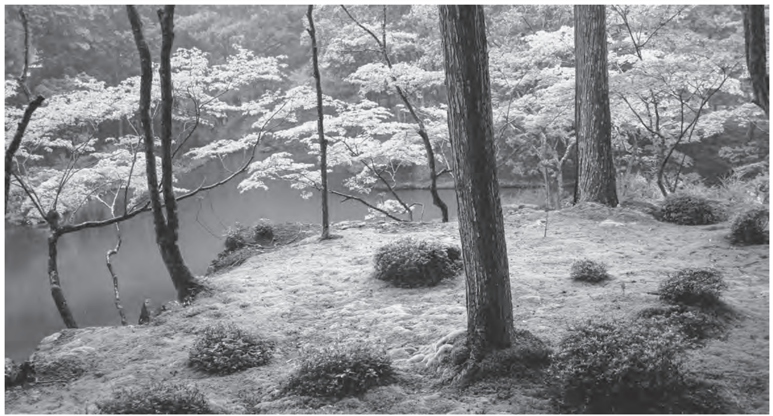
Forest moss garden on the banks of Golden Pond at the Saihōji, Rinzai Zen Buddhist Temple in Matsuo, Kyoto Prefecture, Japan.

Ryōanji, which calls to mind a vast ocean dotted by small islands, or Daisen-in, which features a stone waterfall "pouring" into a vigorously flowing mountain river. The use of rocks as the dominant feature of the garden has both historical and aesthetic origins. Art historians tell us that rocks were highly valued in ancient China and were, in the view of Daoist sages, the very bones of the earth. In this understanding, there is something fundamental to rock that no artifact or even plant can reproduce in terms of revealing the essence of nature and reality. The only thing comparable would be water; rock, like water, is completely nonartificial, nonfabricated, and essentially pure. Yet rock, symbolized by the towering, immovable mountain, exists in contrast to water, which is ever in motion and ever seeking the lowest place available. These two elemental features thus stand in for the basic polarities of yin and yang that are so cher-