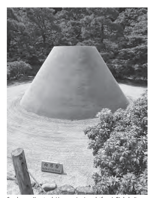
Sand cone, Kogetsudai (moon viewing platform), Ginkakuji Temple (Silver Pavilion), Kyoto, Japan.

components, and design, they all share a primary spiritual function. This function, as has been suggested earlier, is to invite the beholder of the garden to enter into a state of meditative stillness, and, ideally, participate in the perfection of wisdom that the Buddha experienced when he attained the breakthrough of enlightenment.