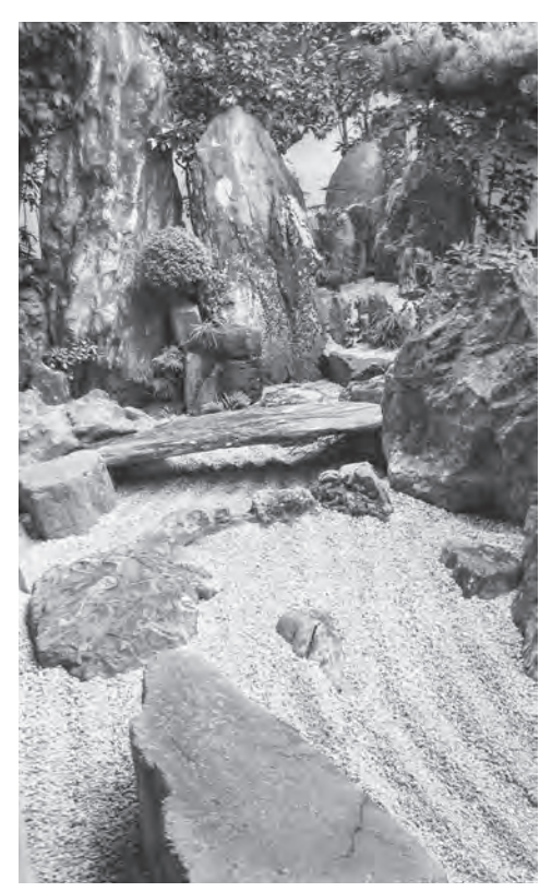
Zen mountains and "waterfall" in the garden of Daisen-in.