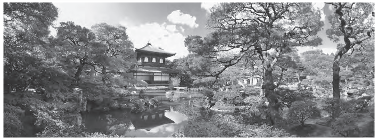
Ginkakuji temple.