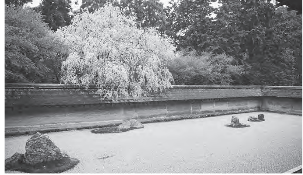
Cherry tree in bloom at the Ryōan-ji Temple dry stone garden in com/hxbzg7m.

Ryōanji, which calls to mind a vast ocean dotted by small islands, or Daisen-in, which features a stone waterfall "pouring" into a vigorously flowing mountain river. The use of rocks as the dominant feature of the garden has both historical and aesthetic origins. Art historians tell us that rocks were highly valued in ancient China and were, in the view of Daoist sages, the very bones of the earth. In this understanding, there is something fundamental to rock that no artifact or even plant can reproduce in terms of revealing the essence of nature and reality. The only thing comparable would be water; rock, like water, is completely nonartificial, nonfabricated, and essentially pure. Yet rock, symbolized by the towering, immovable mountain, exists in contrast to water, which is ever in motion and ever seeking the lowest place available. These two elemental features thus stand in for the basic polarities of yin and yang that are so cher-