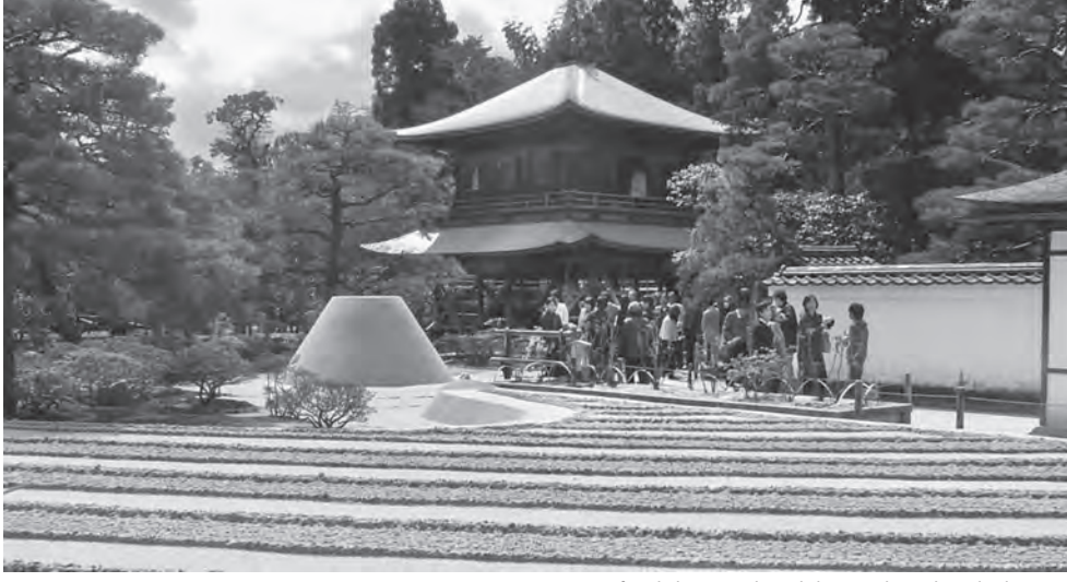
View of Ginkakuji temple with kogetsudai and ginshadan (sea of silver sand). Source: Wikimedia Commons at http://tinyurl.com/i5ccgrm.

The Ginkakuji kogetsudai, whose practical purpose is nonexistent and whose aesthetic purpose can only really be guessed at, gives us an example of another "contemplative" use of the Zen garden, i.e., the labor-intensive construction and maintenance of the garden itself. Visitors to the grounds of a Zen temple will invariably see monks painstakingly weeding and sweeping the gardens with the simplest of tools,