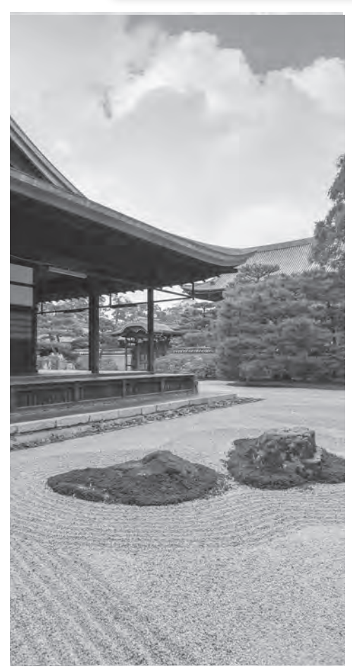
Kennin-ji Temple garden in Kyoto, Japan.