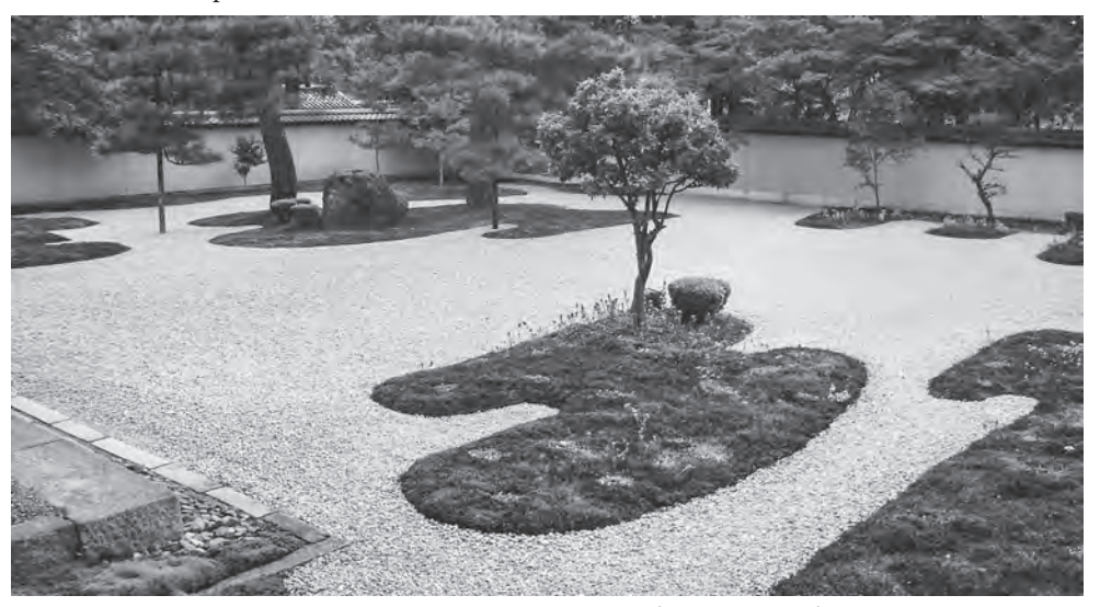
Genji-Garden at Rozanji Temple in Kyoto.

Buddhism made its first appearance in Japan and rock-based temple gardens became more simplified. This followed naturally as the primary meaning of the garden turned from providing a representation of paradise to cultivating meditation through the distillation of sensory information.