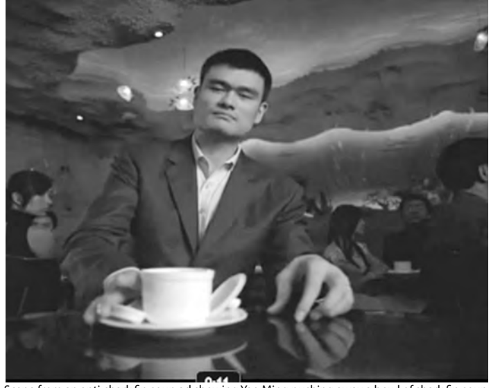
Scene from an anti-shark fin soup ad showing Yao Ming pushing away a bowl of shark fin soup. The voice-over statement for the advertising campaign states, "When the buying stops, the killing can too," from the Stop Shark Finning website at http://tiny.cc/rlbaf.

What is the controversy all about? Upon probing deeper, it involves issues of economic development and broadening prosperity; cultural issues of face and reciprocity; and expanding human control of oceanic resources. On another level, the controversy over shark fin soup reflects discomfort with changing global power dynamics and evokes uncomfortable racial tensions. It can provide a lesson in comparative civics and activism. In Hong Kong, activists have protested consumption of shark fin soup, but legislative changes have yet to be enacted. In the United States, first Hawai`i (2010) and then Washington, Oregon, and California (2011) banned shark fin possession, sale, and consumption. Celebrities like former Houston Rockets player Yao Ming