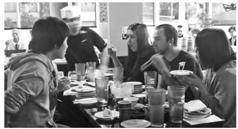
Portland State University students visit a campus sushi restaurant to explore hybrid seafood creations.

I incorporated a unit on shark fin soup and global seafood consumption into my Globalization and Identity in Asia course in winter and spring 2011. In spring 2011, I taught the class to a combined group of matriculated Portland State University students (many of whom hailed from international backgrounds) and Waseda Oregon students—Japanese students in their first quarter of a yearlong academic exchange at Portland State. As in the previous quarter, I showed The Cove and asked students to listen to the KBOO radio program. To further underscore the hybridity of contemporary culinary practices and to give the Japanese students a bit of a cultural dining experience, I took the class to a campus sushi restaurant. The conveyor belt was filled with some seaweed-fish-rice rolls that Japanese students expected to find at a sushi