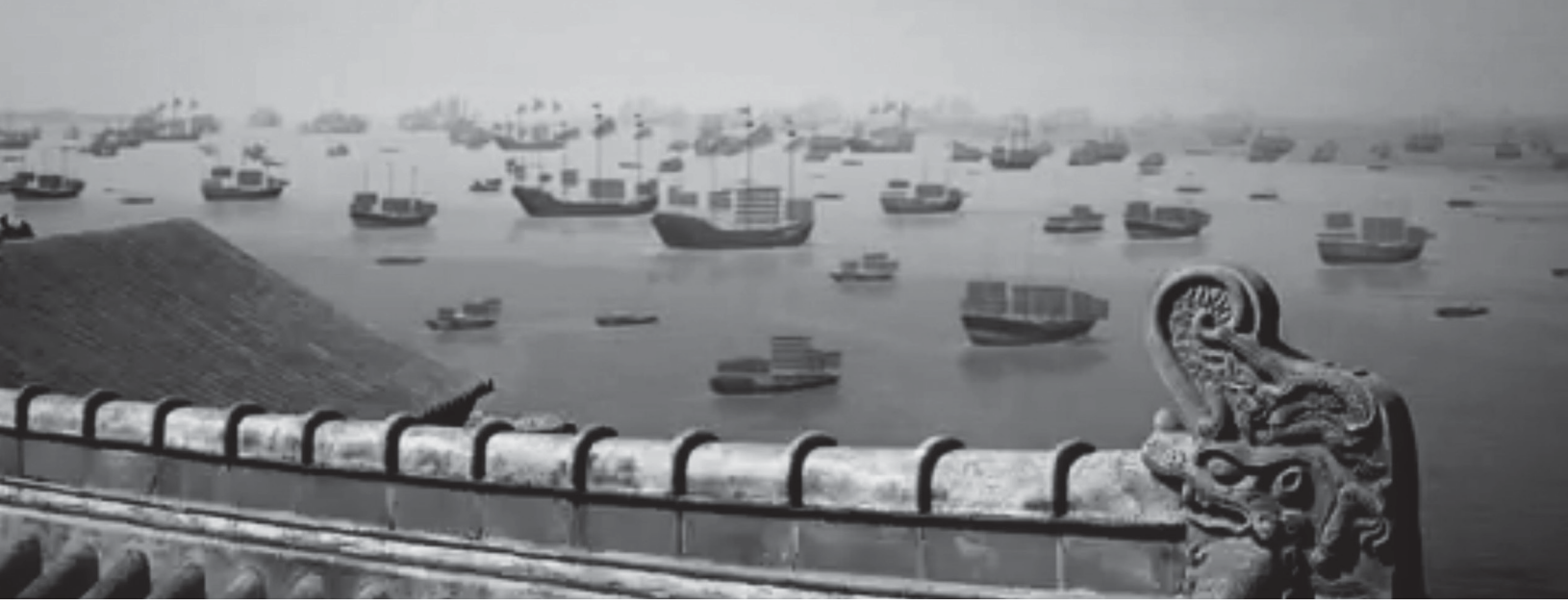
Screen capture from the docudrama Emperor of the Seas depicting Zheng He's fleet of ships in Nanjing harbor the day they set sail for their first voyage. Series available on Amazon.com.

¶ighty years before Vasco da Gama's arrival in West India, a formidable Chinese navy ruled the China Sea and Indian Ocean, from Southeast Asia to the Persian Gulf and East Africa. Between the period from 1405 to 1433, China's Ming dynasty launched seven voyages led by Admiral Zheng He to explore these vast regions, known then to the Chinese as the "West Oceans." One such voyage typically featured over 300 vessels, including a number of "treasure ships" over 400 feet long, accompanied by a legion of supply ships, water tankers, warships with canons, and multioared patrol boats; the total personnel on the fleet numbered over 28,000.1 As has been pointed out, "It was a unique armada in the history of Chinaand the world—not to be surpassed until the invasion fleets of World War I sailed the seas." Rather different from the Europeans, the Chinese armada never sought to establish colonial rule over these oceans by military force. It was by and large intended to facilitate peaceful diplomatic and trade relationships with foreign countries. China's maritime supremacy vanished abruptly in the 1430s because of domestic objections, and the overseas expeditions were eventually ended by the court. All this happened only decades prior to the advent of the great age of European discovery and exploration.