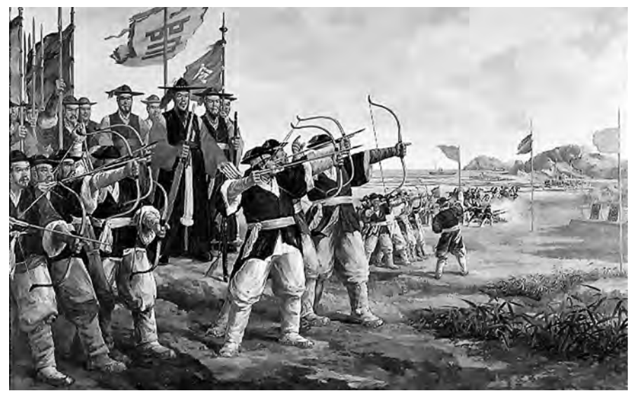
Painting of "Yi Sun-Shin at Training Camp" by Jung Chang (1978).

ors have difficulty enduring criticism when it reflects badly on their own performance.