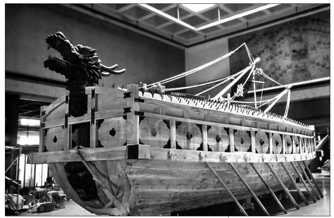
Modern Turtle Ship replica at the War Memorial Museum, Seoul, South Korea.