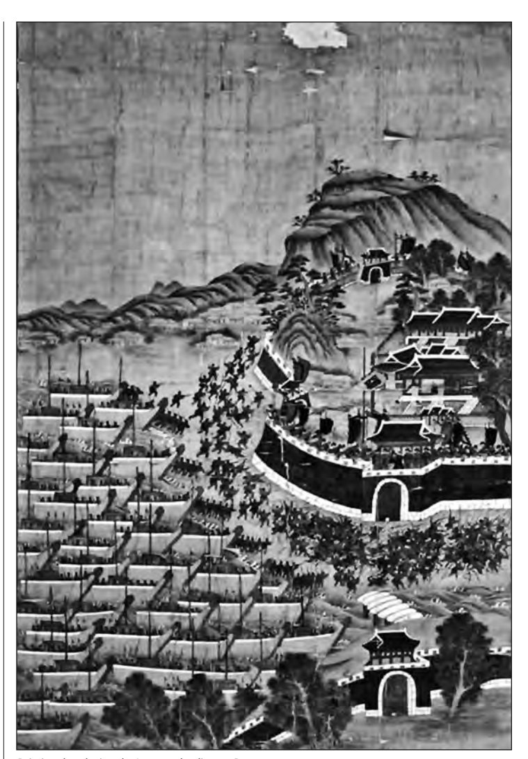
Painting that depicts the Japanese landing on Pusan. Chesungdang (Victory Hall), Hansan Isle.

Like the builders of the caravel in Western Europe, the Koreans built ships with "castles" to better protect their crews from attack by arrows and muskets obtained in Asia from Portuguese and Chinese merchants, and also mounted cannon. Fear of Chinese and Japanese territorial ambitions had led the Korean King Taejong (1367–1423) to create a special gunpowder service unit that experimented with shipmounted artillery. However, it was his son, Sejong (1397–1450), who made the development and use of gunpowder weapons a priority.<sup>11</sup> Korean records suggest that a cannon-armed ship called a "Turtle