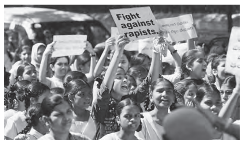
Protest against the Delhi gang rape.