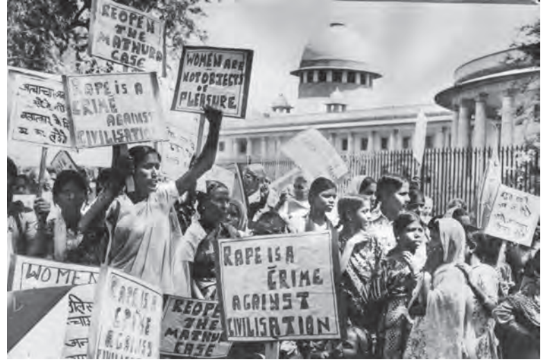
Mathura Rape Case protest.

eople around the world watched as thousands took to the streets in New Delhi in December 2012 following the gang rape of twenty-three-year-old physiotherapy student Jyoti Pandey. While similar protests were held in other metropolitan cities across the country, the protests in Delhi became so intense that the government imposed a curfew and sanctioned the use of force by its riot police. Domestic as well as international media coverage of these events helped fuel public outrage. The protesters made varied and lengthy demands for improving public safety for women, including calls to make public transportation safe; to encourage the police to be more responsive; to reform the judicial process, including reform to the Indian Evidence Act, the Penal Code, and the sentencing standards; and to generally provide for greater dignity, autonomy, and rights for women. As a result of the public outcry, a three-member committee chaired by legal expert Chief Justice J. S. Verma was convened to recommend changes to the criminal law on sexual violence. Based on the committee's recommendations, the government passed the Criminal Law Amendment Act (2013), which addresses a series of concerns expressed by various women's groups, but omits the criminalization of assault perpetrated by spouses or the armed forces.