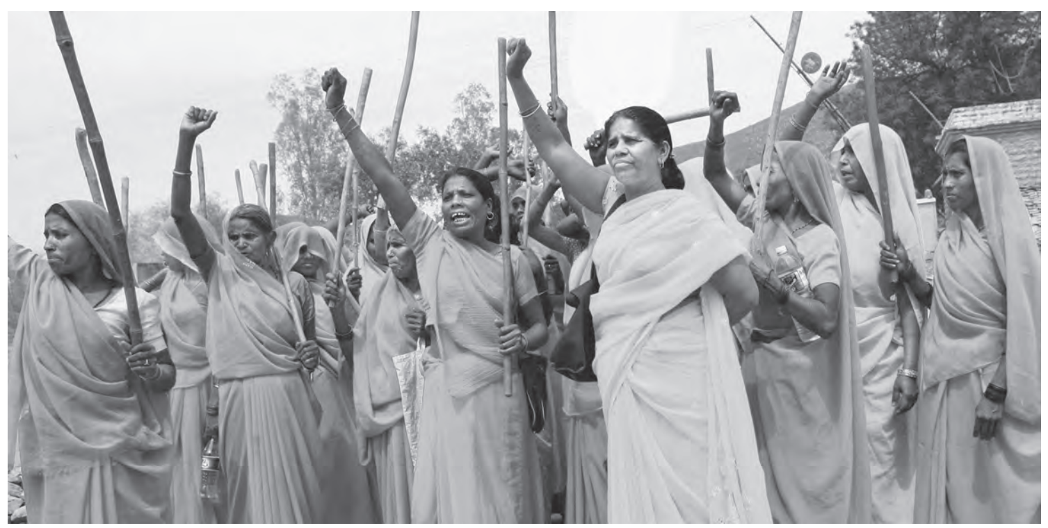
The Gulabi (Pink) Gang Protest. If this were a color photo, you would see that the gang members are all dressed in shades of bright pink.