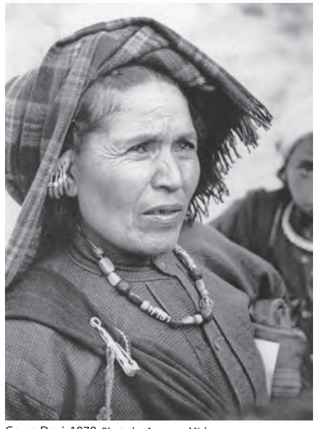
Gaura Devi, 1978.

women and those from marginalized communities was initially intended to address the economic consequences of failed state-led development schemes rather than directly dealing with gender injustices.