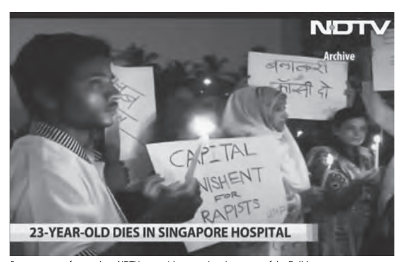
Screen capture from a short NDTV news video covering the events of the Delhi gang rape.