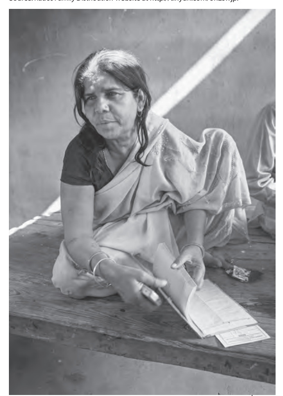
Gulabi Gang founder and leader Sampat Pal.