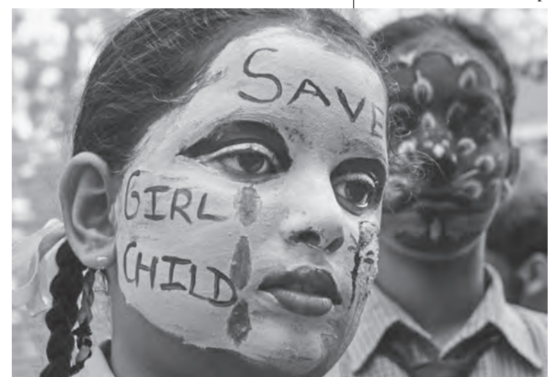
"India loses 3 million girls in infanticide," The Hindu, October 9, 2012. During 2001–2011, the share of children to total population has declined and the decline was sharper for female children.

Despite the widespread solidarity against anti-women violence of earlier years, contemporary women's organizations greatly differ with regard to ideology, class, sense of identity, and understanding of the sources of gender inequality. Some have their roots in massive leftist organizations like All India Democratic Women's Association (AIDWA) with ties to political parties, while other organizations avoid any affiliation with existing political actors and institutions. So-called autonomous women's groups, such as Saheli, emphasize the building of feminist organizational structures and