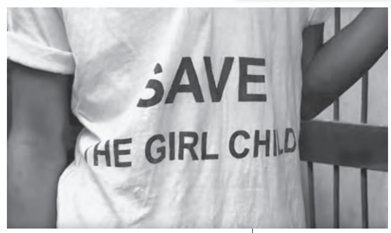
Screen capture of a boy wearing a "Save the Girl Child" T-shirt from the CNN documentary, India: The Most Dangerous Country in the World to Be a Girl!

and decreases from primary to secondary to tertiary education, leaving males generally better educated and with more employment opportunities. While the attendance gender gap among girls and boys in primary school is 3.8 percent, it increases to 9.8 percent at the secondary school level. As a result, there is a significant difference in youth literacy rates (ages fifteen to twenty-four) between young women (74.4 percent) and young men (88.4 percent); and among adult women, only 67.6 percent are literate.