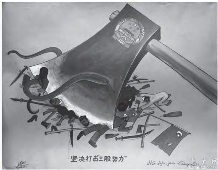
"Eliminating Extremism." This is a sample from the "peasant painting" collection, a campaign that was organized by the Xinjiang government to promote official counterterrorism rhetoric. The painting depicts an axe bearing the crest of the Chinese Communist Party cleaving into corpses of men and women wearing traditional Islamic clothing as well as a large serpent. Weapons such as knives, axes, and homemade bombs, as well as flags with the Islamic star and crescent symbol, litter the floor. The caption at the bottom states, "Yow to Destroy the 'Three Forces": extremism, terrorism, and separatism.

he Xinjiang Documentation Project (XDP) is a multidisciplinary collaborative project based at the Institute of Asian Research in the School of Public Policy and Global Affairs at the University of British Columbia and cosponsored by the Department of Gender, Sexuality, and Women's Studies and the School for International Studies at Simon Fraser University. The XDP collects, assesses, preserves, and makes available documentary information on the state policies and experiences of extrajudicial detention of Uyghurs, Kazakhs, and other ethnic groups in Xinjiang Uyghur Autonomous Region, northwestern China. The project's priorities are to evaluate and disseminate reliable documents for the general public, giving a platform for individuals to share their lived experiences, providing regular updates on developments in the region, and organizing periodic speaker events. The XDP is also an effort to document the experiences and memories of those in Xinjiang for future truth and reconciliation work. Such documentation is vital for the survival of colonized societies.