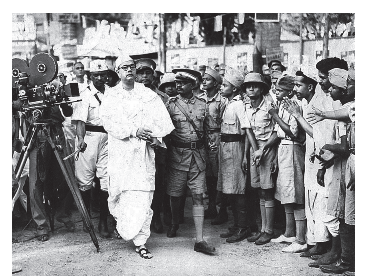
Subhas Chandra Bose arriving at the 1939 meeting of the All India Youth Congress (the central presidium of the Congress Party).

Bose returned to India convinced that only more forceful action by Indians and their leaders would bring about Indian independence. In 1938, his obvious passion