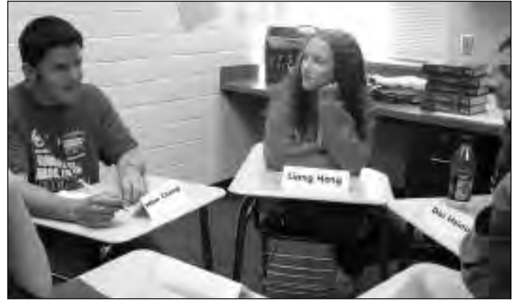
Students at Dulles High School in Sugar Land, Texas, discuss the impact of China's Cultural Revolution from the perspective of the person they researched earlier in the period. Photos provided by Deborah Pellikan.

When the "reader's theater" approach is used, each group dramatizes the events in their assigned reading, as these Ft. Bend ISD students are doing. Photos provided by Deborah Pellikan.