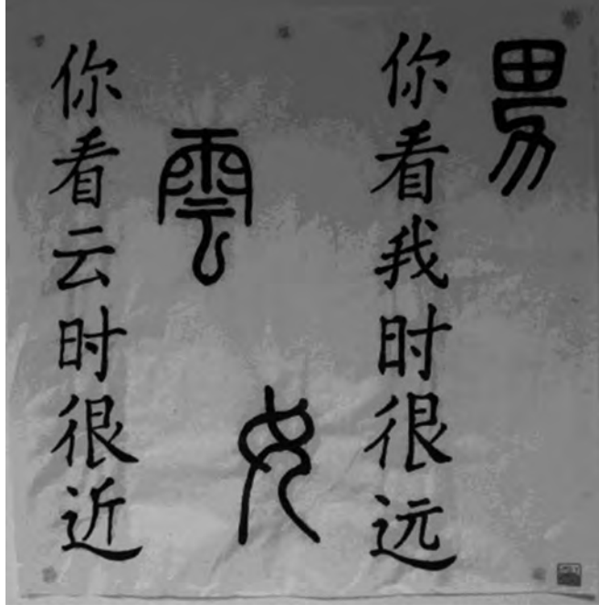
Figure 1. T-shirt Project: "Our Modern Oracle Bones."