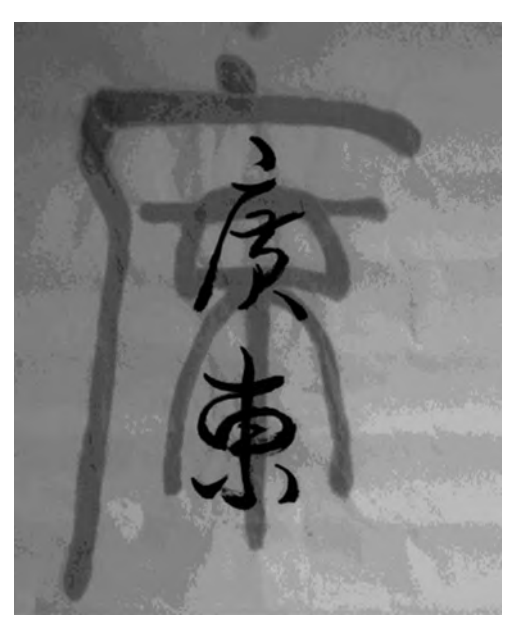
Figure 3. Elsa Lake (untitled).

that partnered undergraduates with elders at a community center. For the freshmen, the focus of the course was exploration of value systems, ethics, and community building. We used calligraphy as a means to help students better understand course content through embodied practice and as part of a project of compassionate engagement with the community outside campus boundaries.